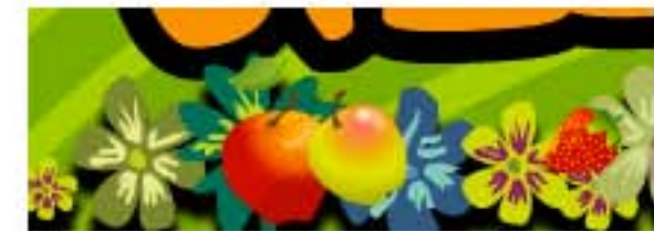
Detail showing drop shadow