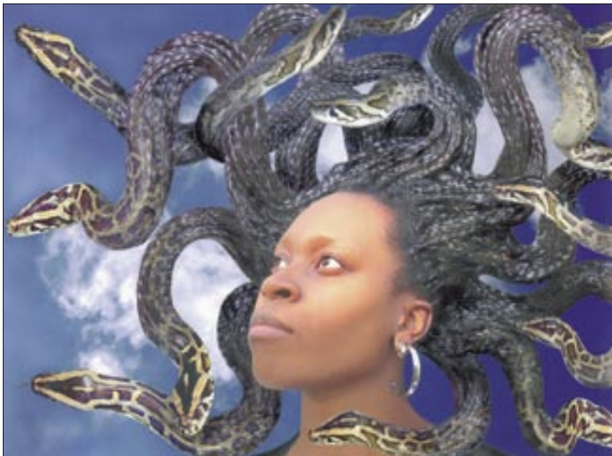
3. Tania Joyce, Medusa , c. 1995, digital photography.