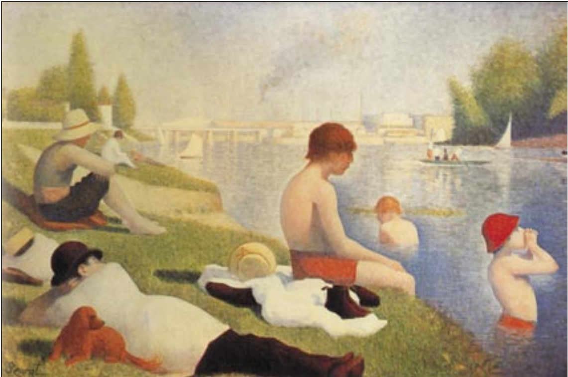
5. Georges Seurat, Bathing at Asnieres , 1883, oil on canvas.