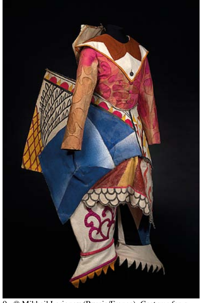
9. © Mikhail Larionov (Russia/France), Costume for a buffoon's wife, for Les Ballets Russes (The Russian Ballet), cotton, cane, painted cotton buckram, silk dyed, painted, appliqué, c. 1921