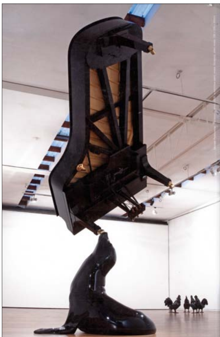
395 \times 200 \times 260 cm

11. © Michael Parekowhai (New Zealand), The Horn of Africa , installation, automotive paint, wood, fibreglass, steel, brass, 2006