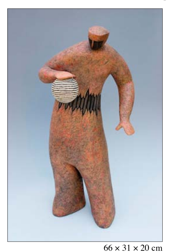
3. © Fred Yokel (USA), Check This Out , coil built ceramic, low fire glaze and underglazes, raku fired, 2007