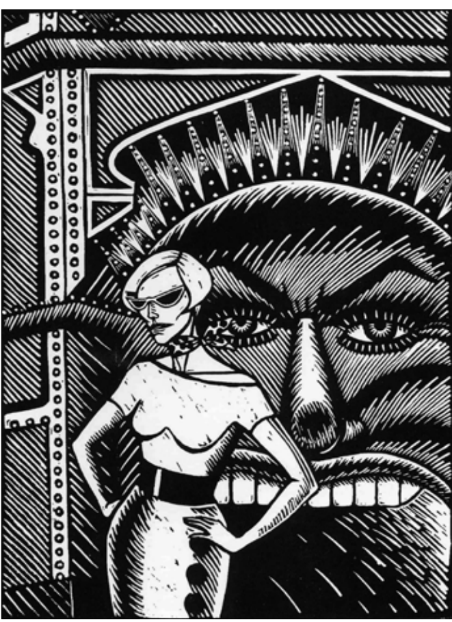
61 \times 35 cm