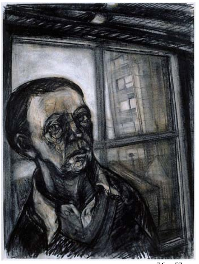
76 \times 57 cm