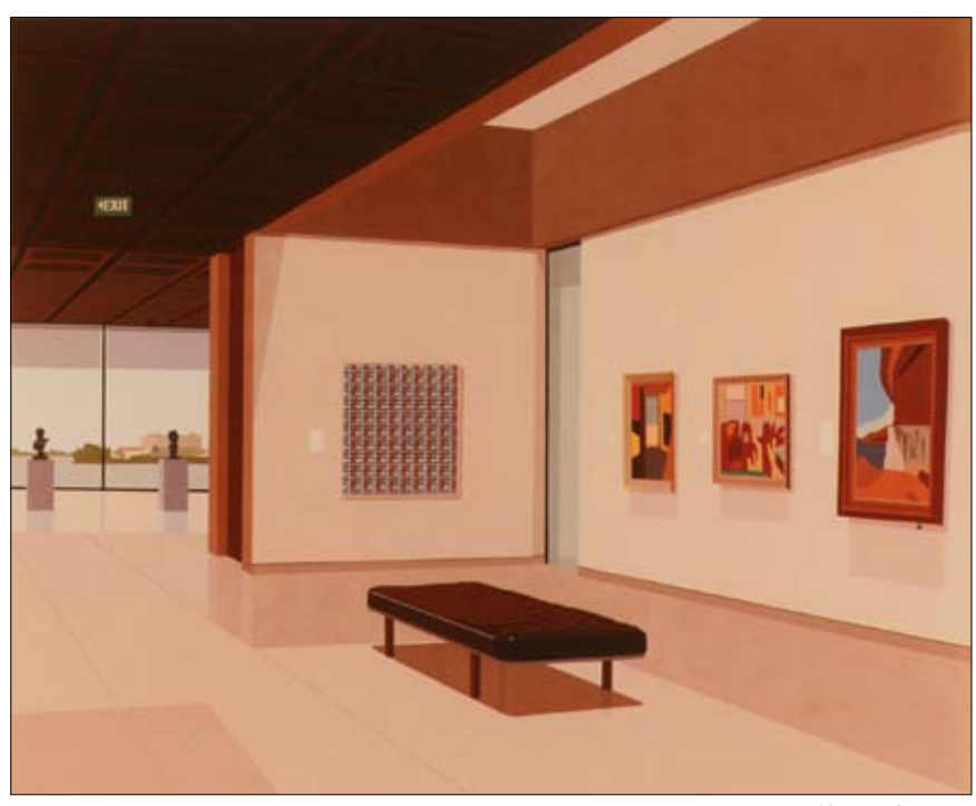
152 \times 187 \text{ cm}