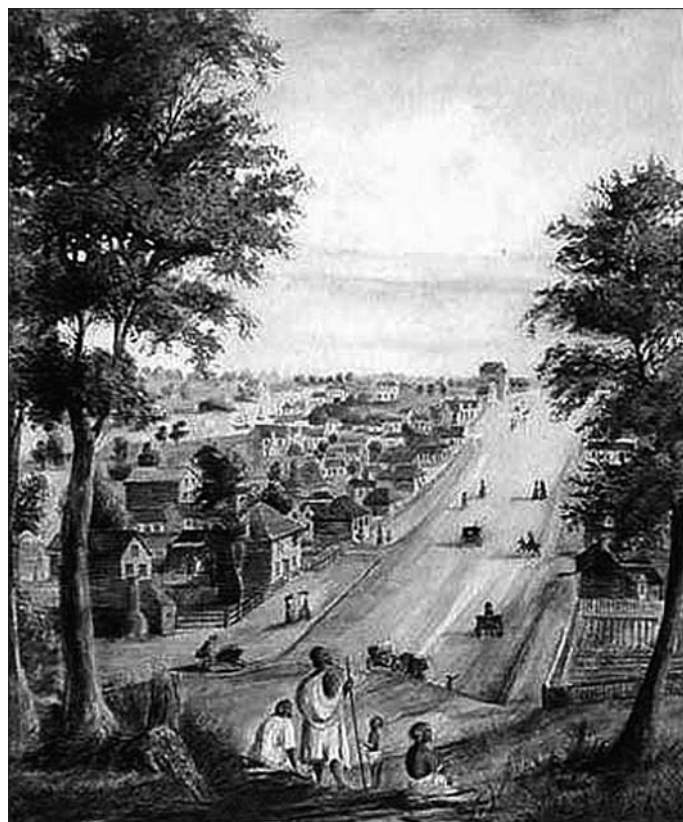
W Knight, Collins Street, town of Melbourne, New South Wales, 1839

Answer the questions which follow one of the following documents (Document A or Document B).