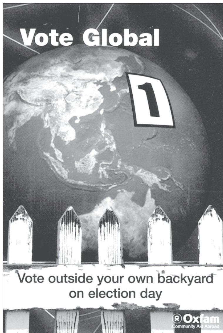
front of postcard

This postcard was produced and distributed before the 2001 Australian Federal election by Oxfam Community Aid Abroad. Oxfam Community Aid Abroad is the Australian part of an international nongovernment organisation based in England. The organisation gives aid and development assistance around the world. This postcard was distributed to supporters of Oxfam Community Aid Abroad throughout Australia.