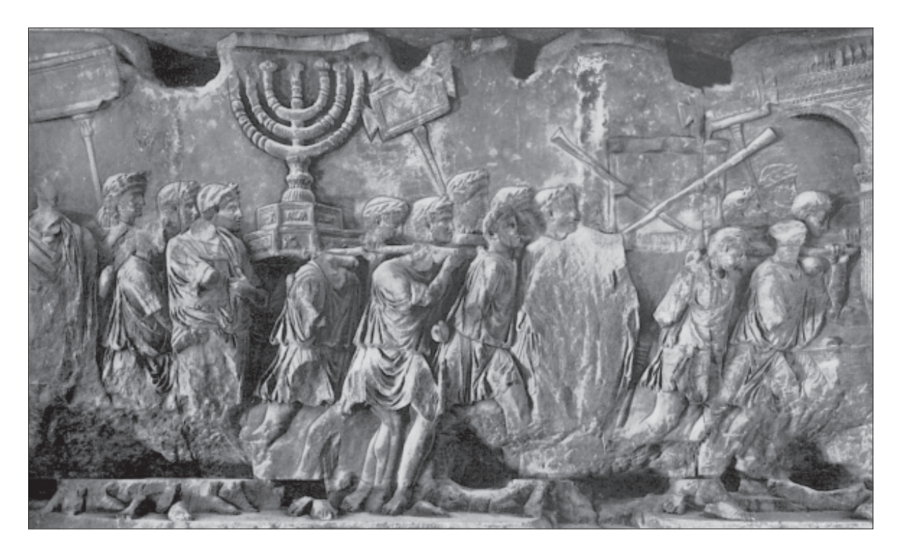
Procession of soldiers with spoils of Jewish War from the Arch of Titus

Discuss the way this relief sculpture from the Arch of Titus is used to tell a story. How is the Arch, as a whole, typical of Roman architecture?