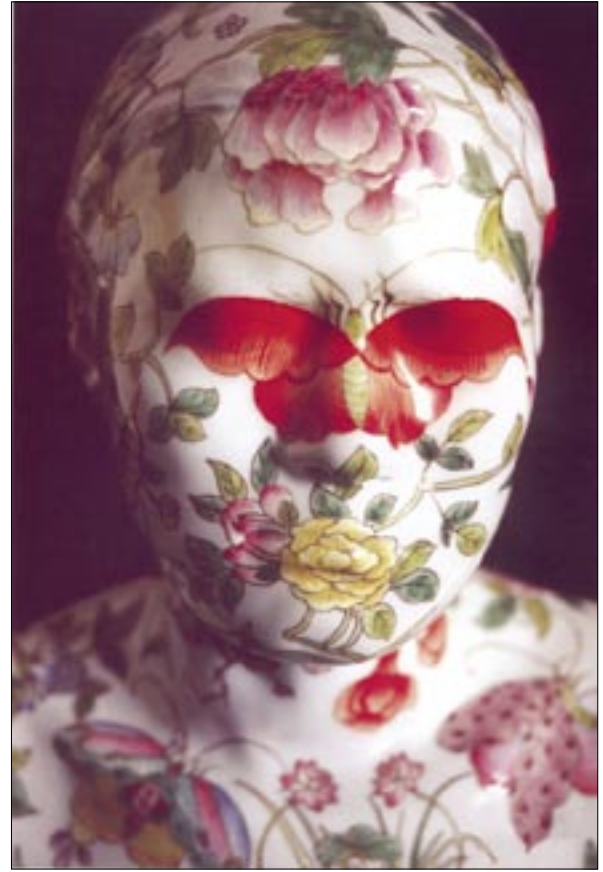
37 × 33 × 23 cm