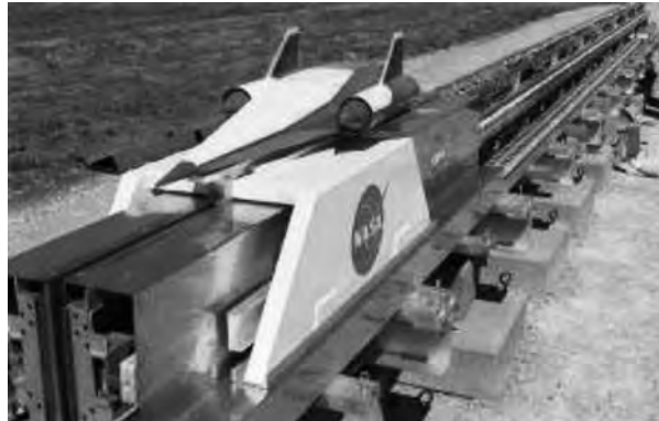
Fig. E4.1 Photo: NASA tests a linear motor on a prototype Maglev railroad, 1999. Tracks like this could be used to launch vehicles into space in future.

Linear motors are electric motors that produce motion in a straight line rather than rotational motion. In a traditional electric motor, the rotor (rotating part) spins inside the stator (static part); in a linear motor, the stator is unwrapped and laid out flat and the “rotor” moves past it in a straight line. Linear motors often use superconducting magnets, which are cooled to low temperatures to reduce power consumption.