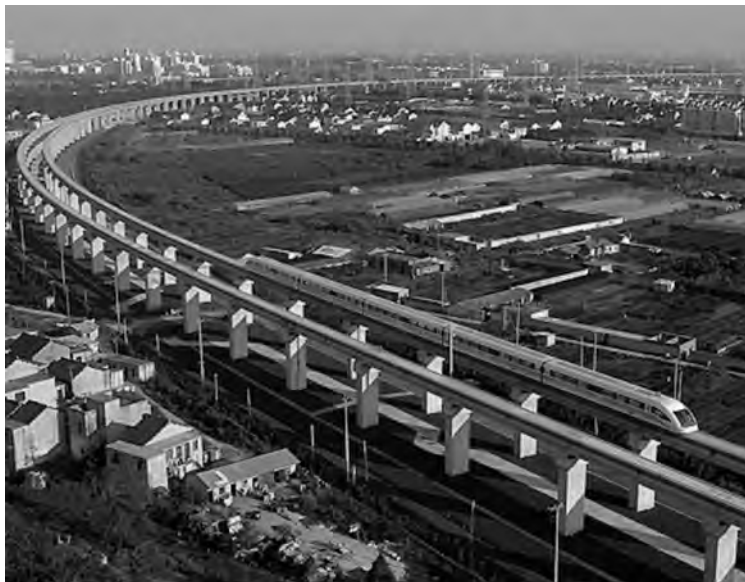
Fig. E2.2 History-making maglev speeds between stations

Construction began in April 2001 of the first commercial Transrapid system. Despite the fact that the maglev was the first revenue-producing point-to-point high-speed maglev in the world, the system was up and running by 2004. The 30km line runs between Pudong Shanghai International Airport and the Shanghai Lujiazui financial district. An end-to-end ride takes about eight minutes. A world record for commercial maglev systems was set on November 12, 2003. A five-section train achieved the top speed of 501 km/h (311 mph) while another vehicle passed at 430 km/h (267 mph) on the adjacent track. The Transrapid in Shanghai has a design speed of over 500 km/h and a regular service speed of 430 km/h. Shanghai Maglev is the fastest railway system in commercial operation in the world. Other maglev lines are under consideration in China.