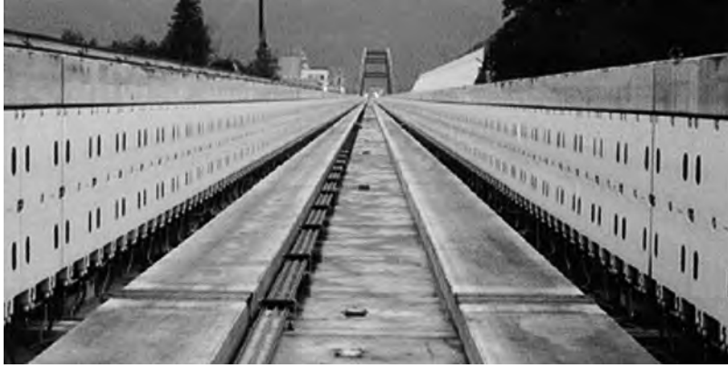
Fig. E1.2 An image of the guideway for the Yamanashi maglev test line in Japan

Adapted from: Bonsor, Kevin. "How Maglev Trains Work" 13 October 2000. HowStuffWorks.com. < http://science.howstuffworks.com/transport/engines-equipment/maglev-train.htm > 11 January 2011.