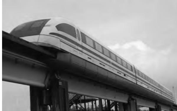
Fig. E1.1 The first commercial maglev line made its debut in December of 2003.

If you've been to an airport lately, you've probably noticed that air travel is becoming more and more congested. Despite frequent delays, aeroplanes still provide the fastest way to travel hundreds or thousands of miles. Passenger air travel revolutionised the transport industry in the last century, letting people traverse great distances in a matter of hours instead of days or weeks.