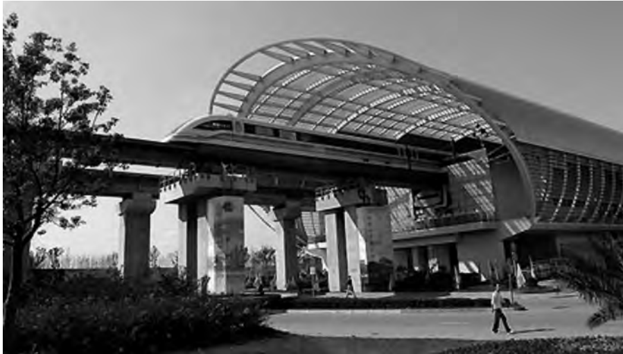
Fig. E2.1 Transrapid train emerges from the stylish station in Shanghai

Construction began in April 2001 of the first commercial Transrapid system. Despite the fact that the maglev was the first revenue-producing point-to-point high-speed maglev in the world, the system was up and running by 2004. The 30km line runs between Pudong Shanghai International Airport and the Shanghai Lujiazui financial district. An end-to-end ride takes about eight minutes. A world record for commercial maglev systems was set on November 12, 2003. A five-section train achieved the top speed of 501 km/h (311 mph) while another vehicle passed at 430 km/h (267 mph) on the adjacent track. The Transrapid in Shanghai has a design speed of over 500 km/h and a regular service speed of 430 km/h. Shanghai Maglev is the fastest railway system in commercial operation in the world. Other maglev lines are under consideration in China.