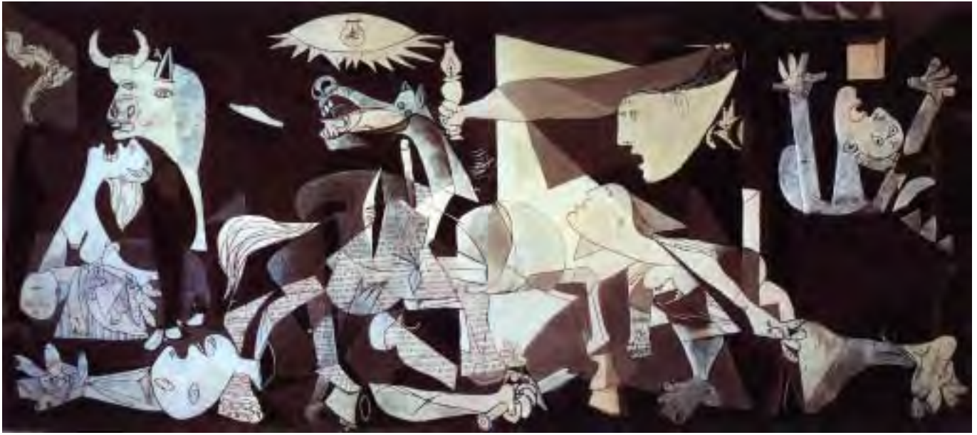
Pablo Picasso, Guernica , 1937 (oil on canvas) (349.3 x 776.6 cm) (Museo Reina Sofía, Madrid)