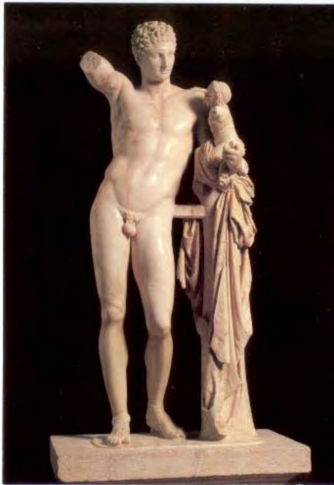
Praxiteles, Hermes and Dionysus , c. 340BC. Marble (213 cm high) (Olympia)