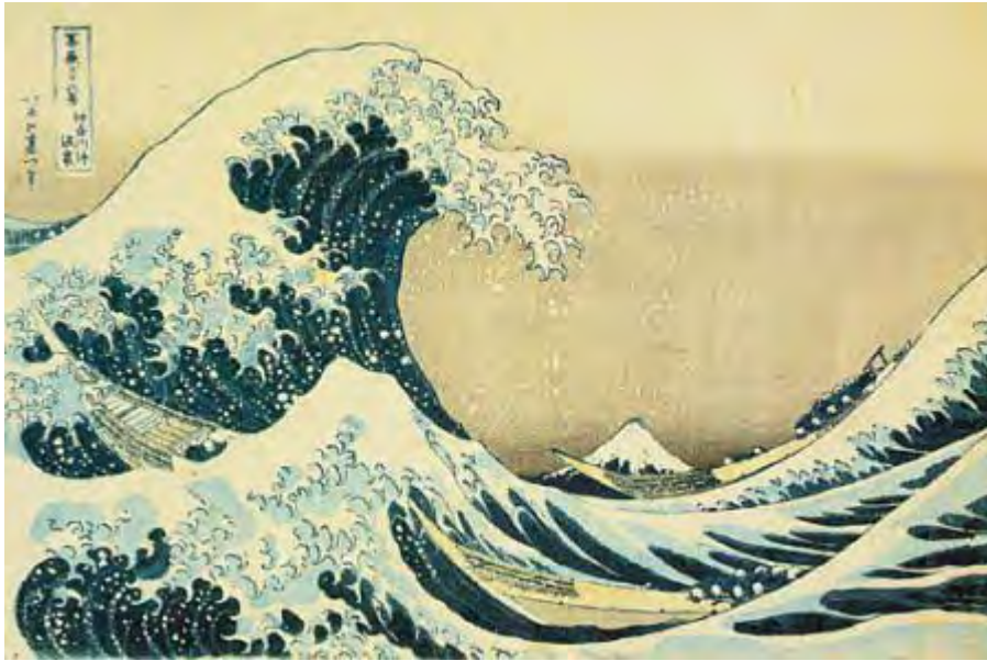
Katsushika Hokusai, The Great Wave off Kanagawa 1823–39 Polychrome woodblock print (255 x 375 mm)