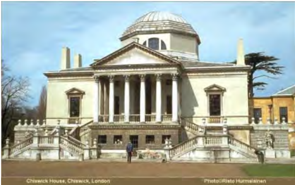
Lord Burlington and William Kent, Chiswick House , 1729 (stone) (Chiswick, London)