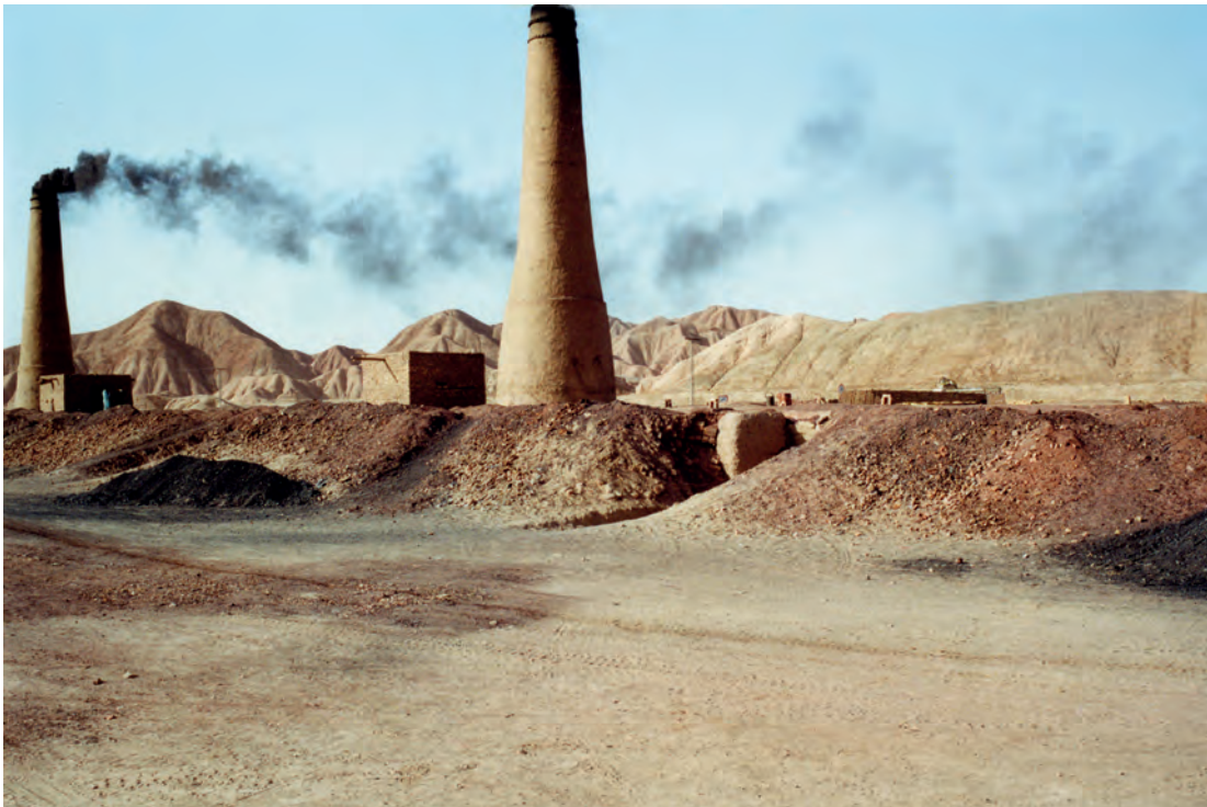
Photograph B for Question 2