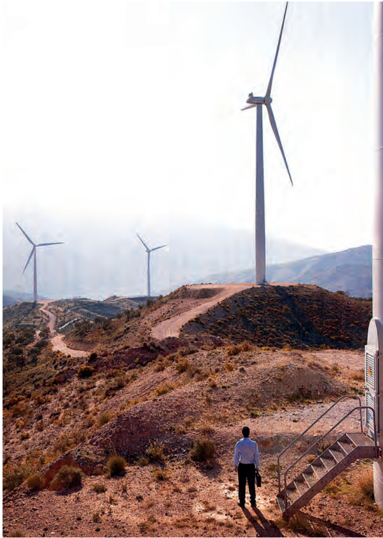
Photograph D for Question 4