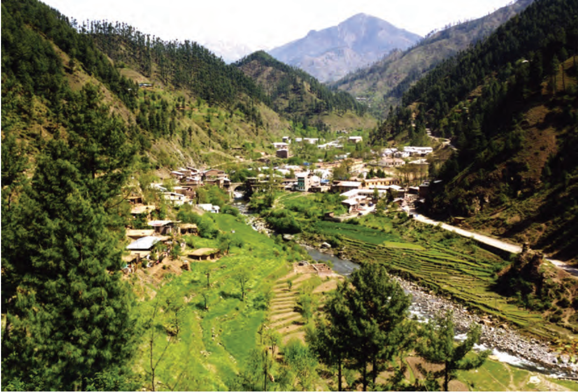
Photograph C for Question 3