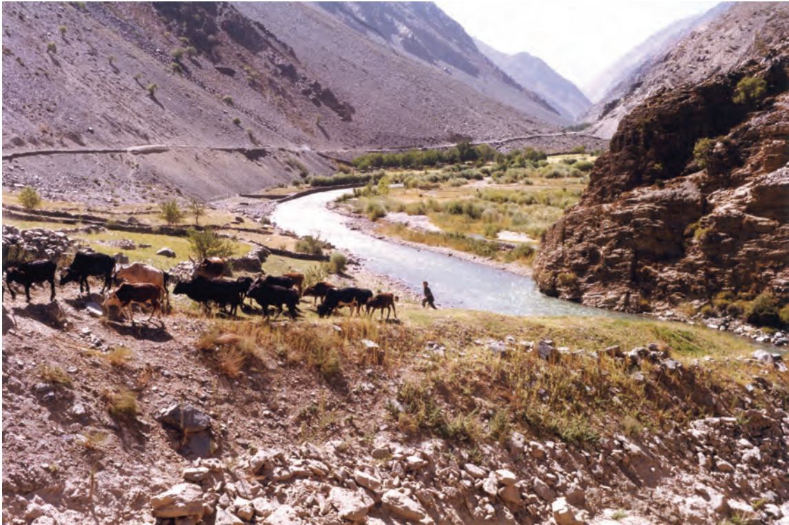
Fig. 3 for Question 2