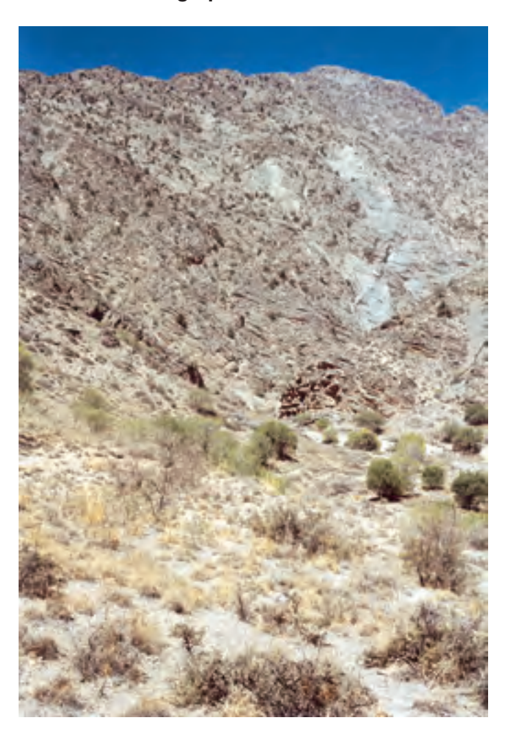
Hazarganji-Chiltan National Park, near Quetta