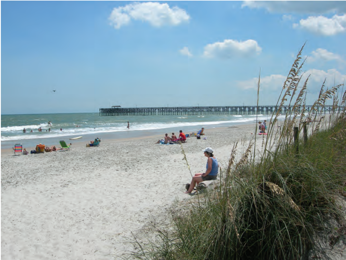
Photograph F for Question 5