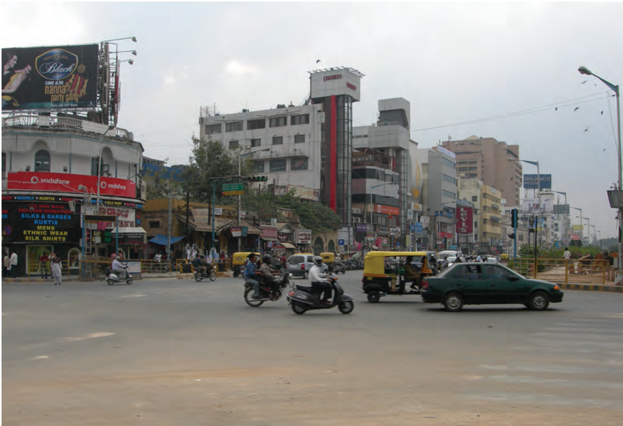
Photograph B for Question 2