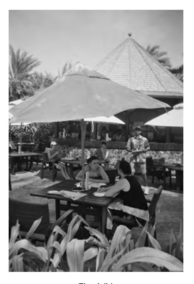
Fig. 1 (b)

Explain two ways in which food and drink outlets, such as the one shown in Fig. 1(b), provide a comfortable service environment for guests.