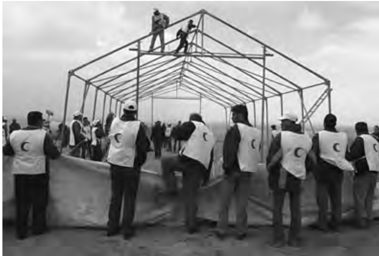
Muslim aid workers putting up a tent for preparing hot meals and storing relief items in a refugee camp in Jordan.