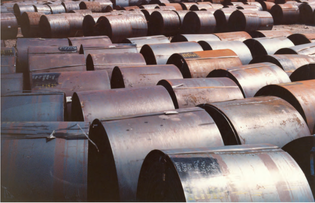
Photograph E for Question 4