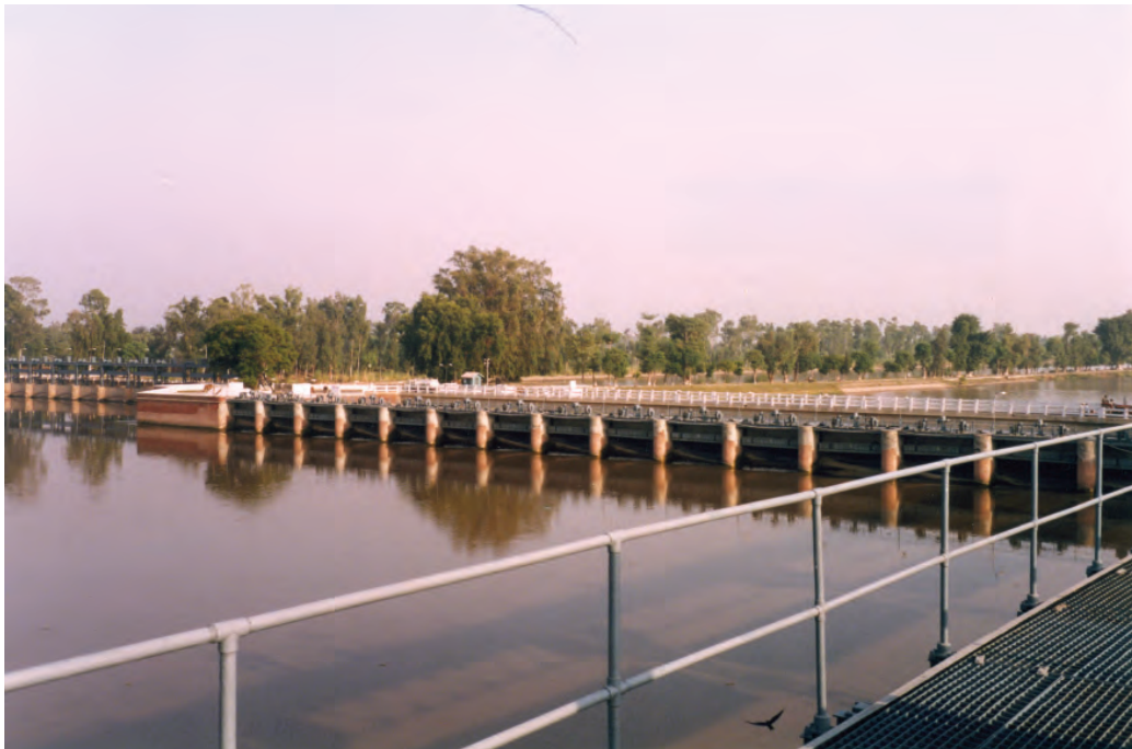
Photograph B for Question 1