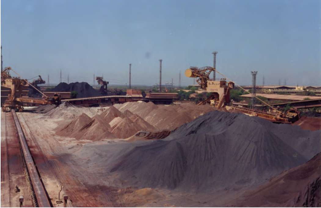
Photograph C for Question 4