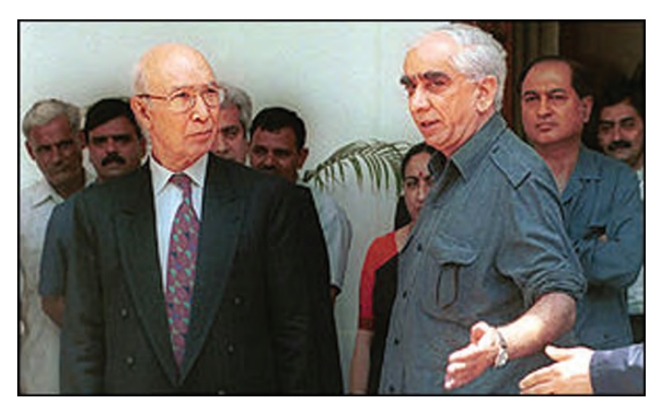
The Foreign Ministers of India and Pakistan during talks on Kashmir, June 1999

Explain why it is so difficult to resolve the Jammu and Kashmir conflict.