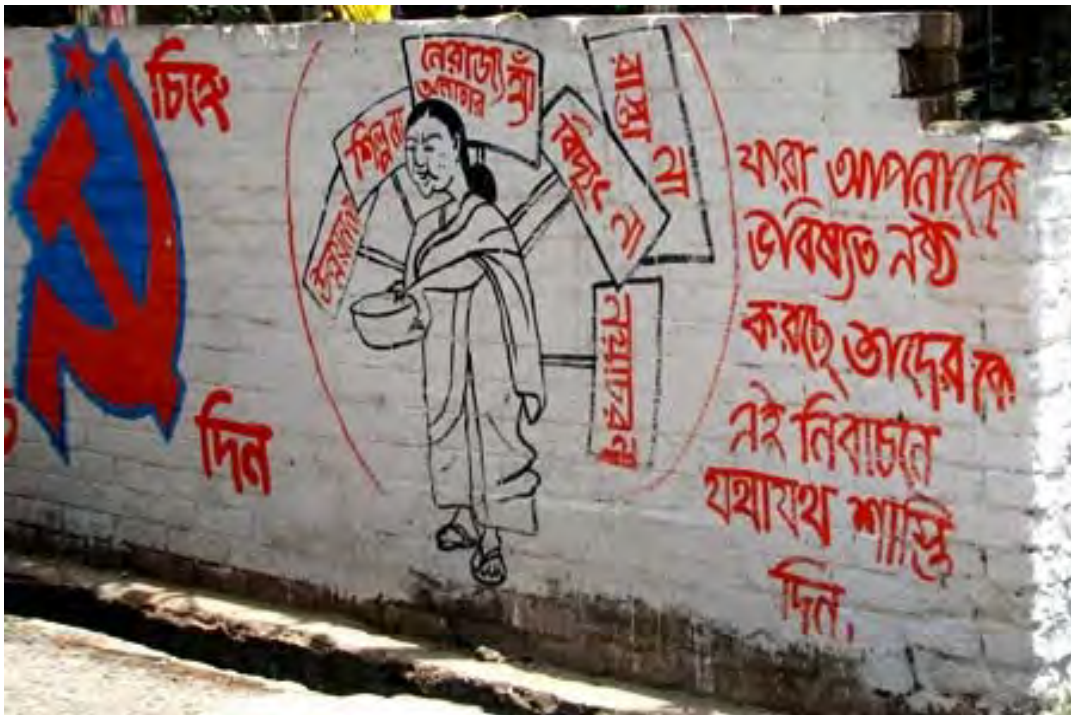
Party-political campaign graffiti in West Bengal