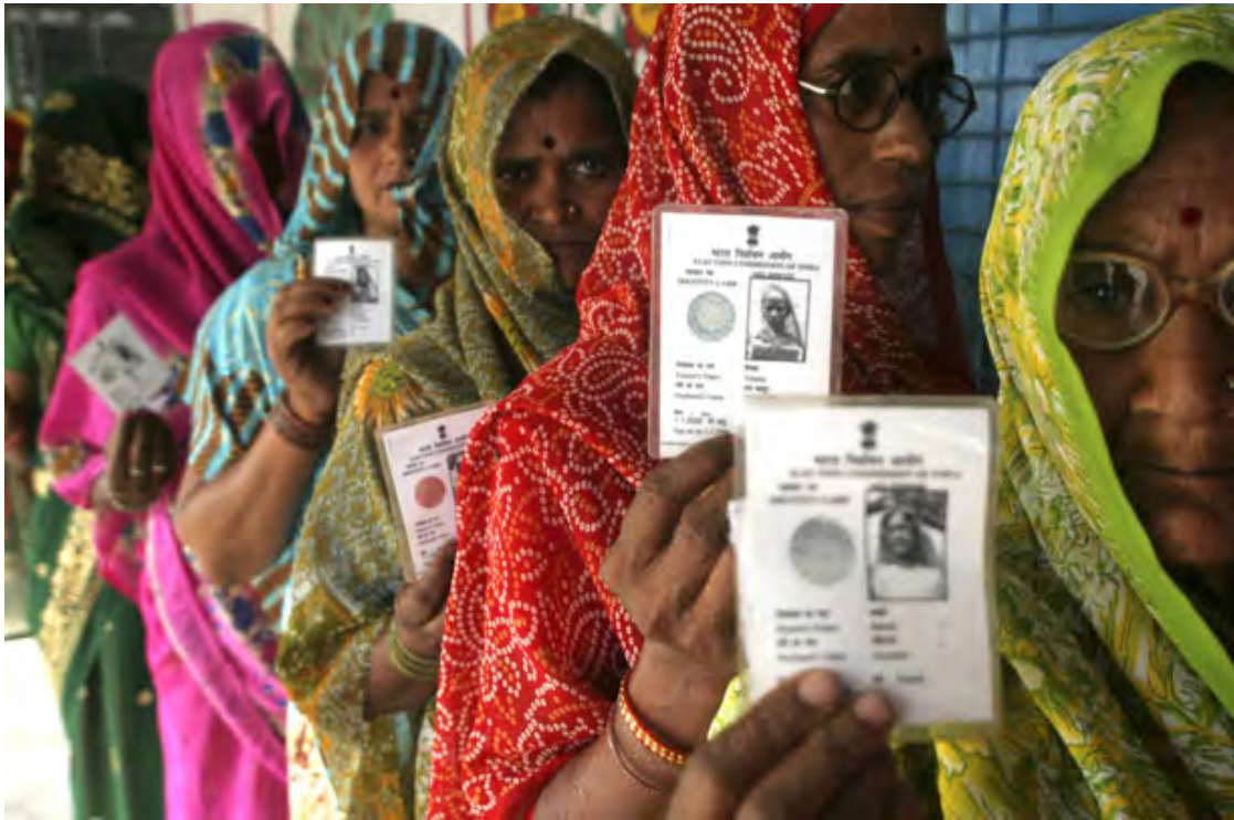
Checking voter identity