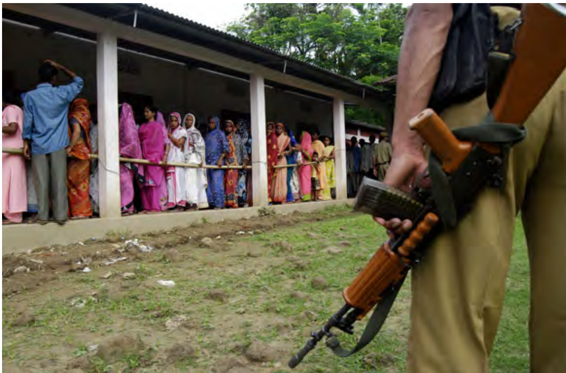
Security at a polling station in Silchar