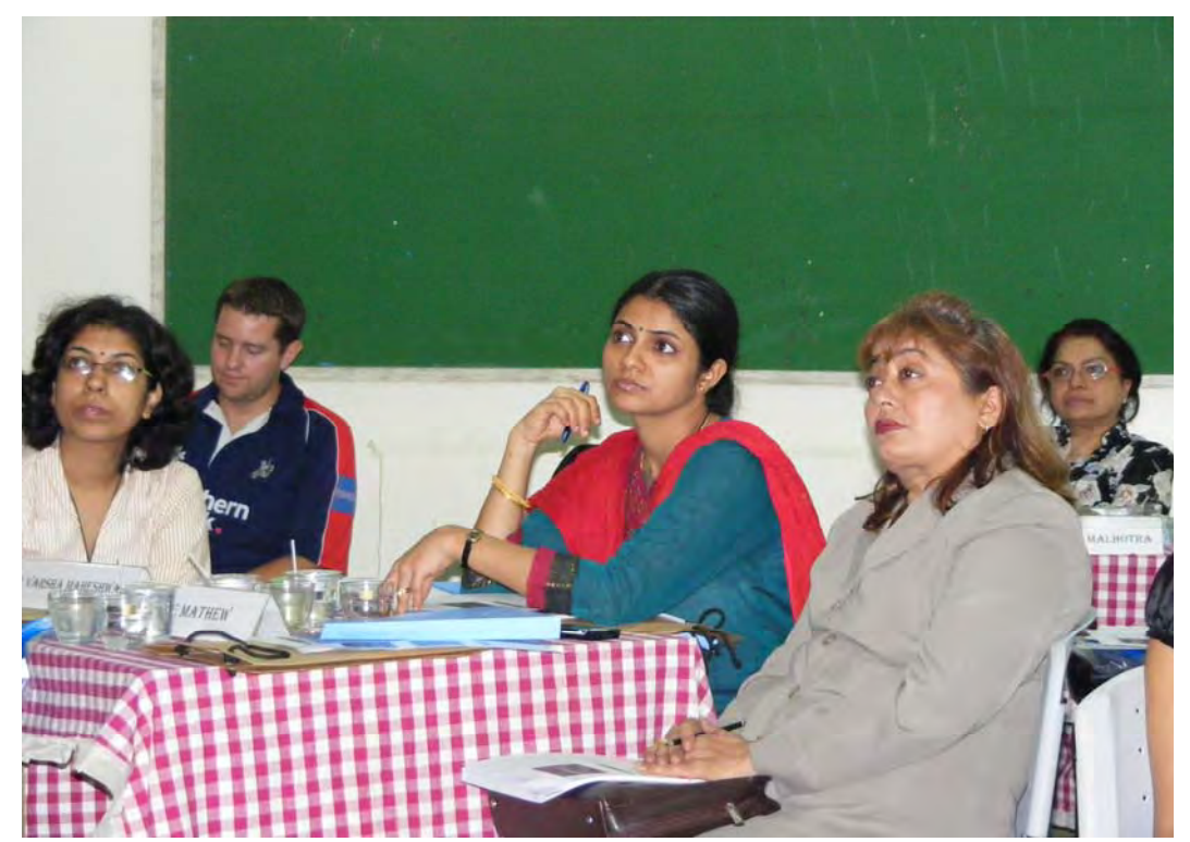
Download this photo – 286k