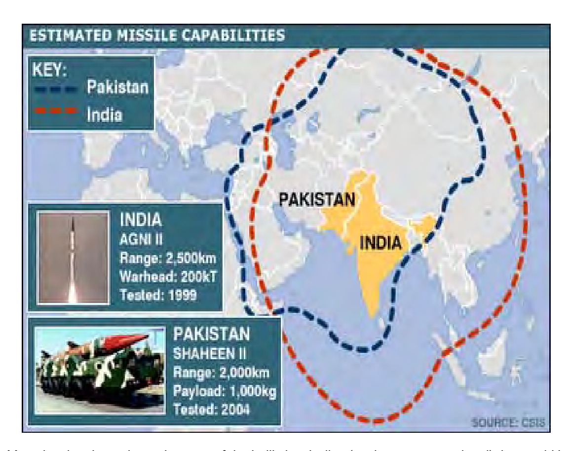
Map showing the estimated ranges of the ballistic missiles (nuclear or conventional) that could be launched by India and Pakistan, 2004 Download this map – 28k

If you have suggestions for specific visual items that we might circulate in future issues of India Matters and add to the teacher resource bank, please post them on the eDiscussion Forum, including details of what they are and where they came from.