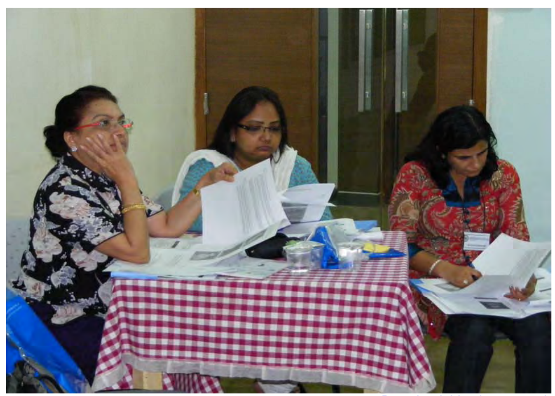
Download this photo – 266k