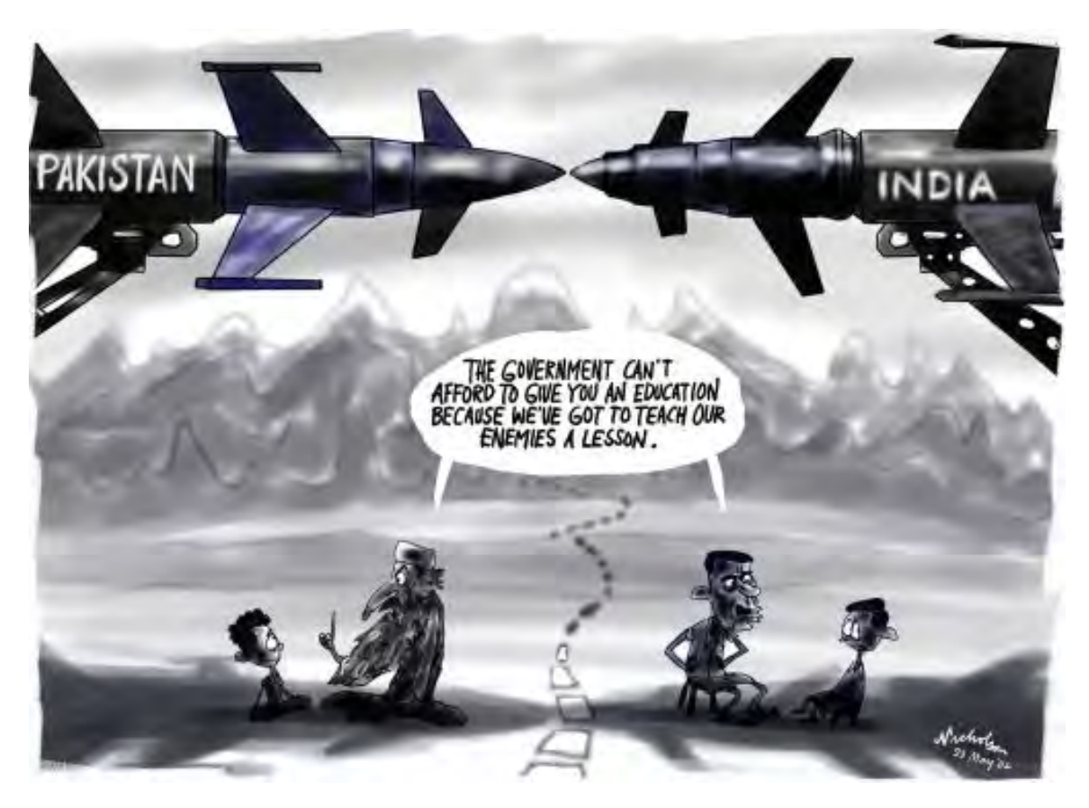
A cartoon from The Australian , published 2003 Download this image – 49k

The idea for building up a visual resources bank has been well received: here is the next input from Cambridge. For this issue, we have chosen three cartoons and a map on the subject of India as a nuclear power. These might be of value when considering with your class various aspects of Paper 1 Theme 4 ('India & the world').