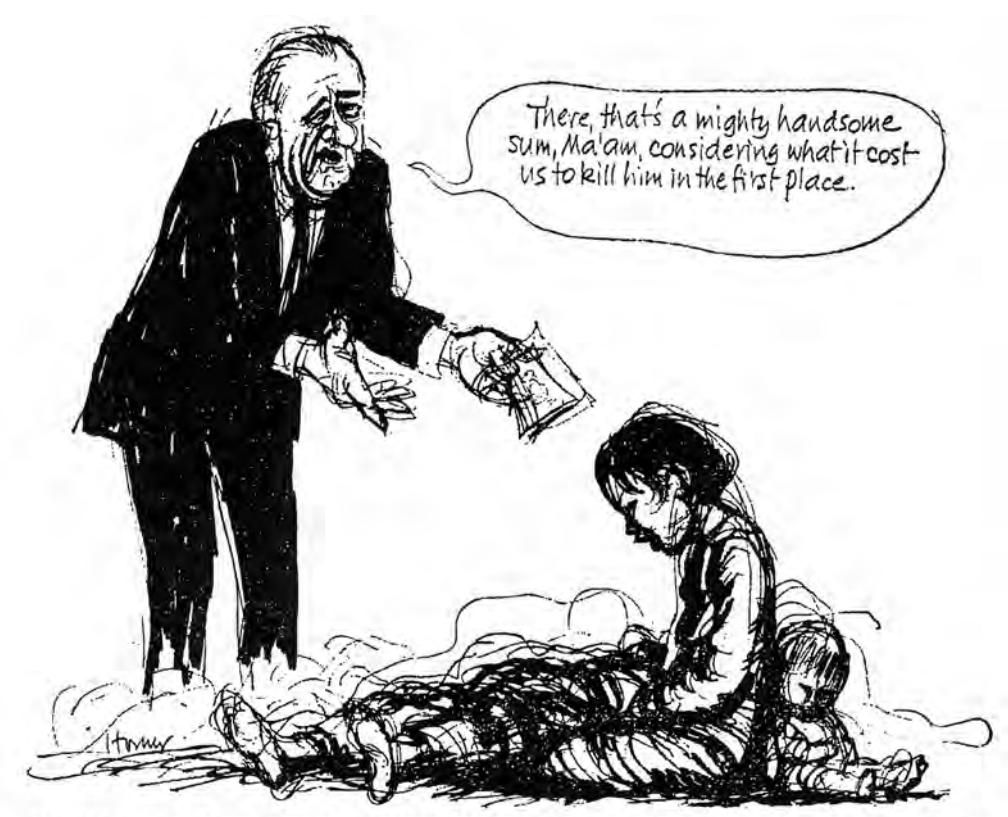
(The US is spending more than $40,000,000 per day on the war in Vietnam; compensation payments for South Vietnamese civilians killed 'by mistake' are $34 per head.)