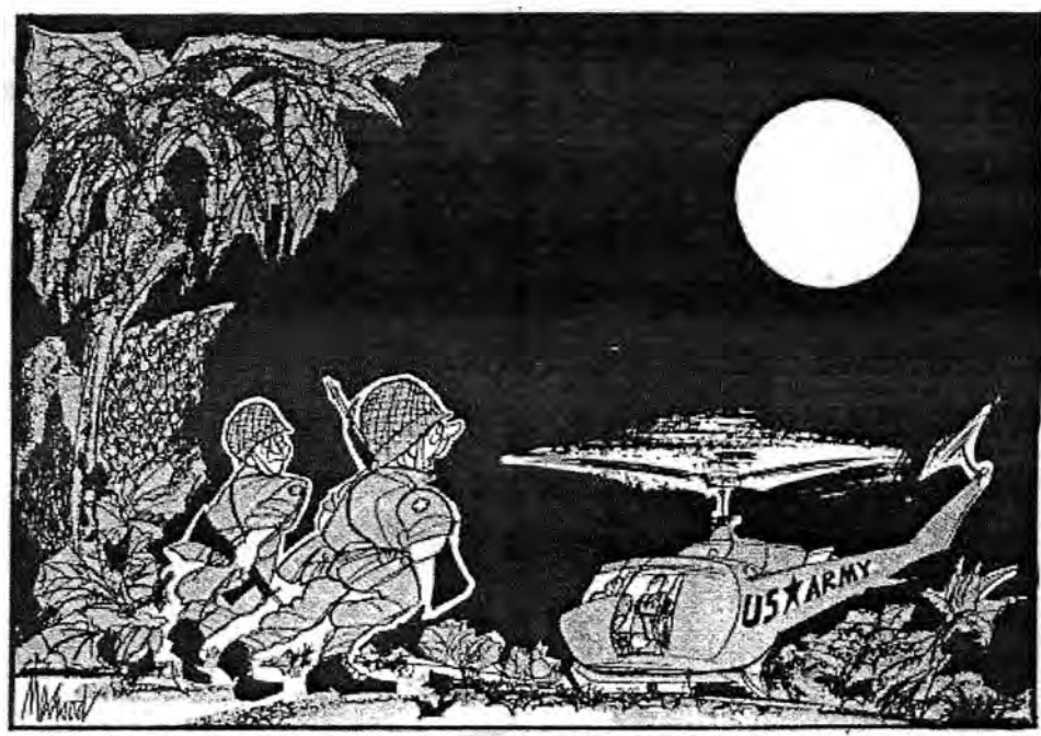
"You know what I dread? If they do find life up there it will be another poor democratic people threatened by the Commies!"

A cartoon published in Britain in 1969. US astronauts landed on the moon for the first time that year.