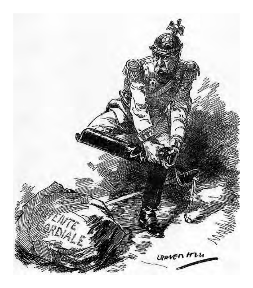
A British cartoon, entitled 'Solid', published in August 1911. The Kaiser is saying 'Donnerwetter! It's rock. I thought it was going to be paper.'