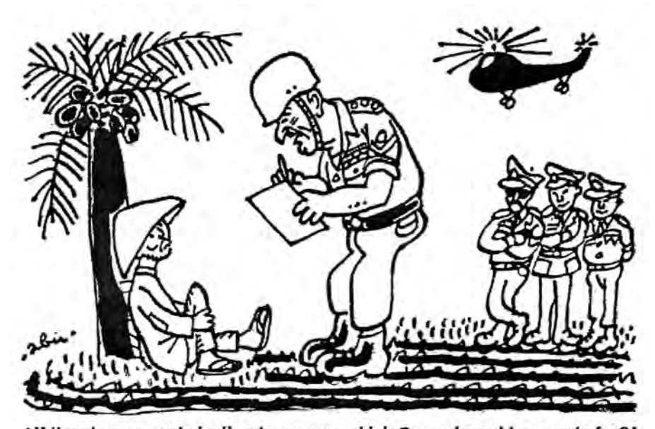
'If there's a general election tomorrow, which General would you vote for?'