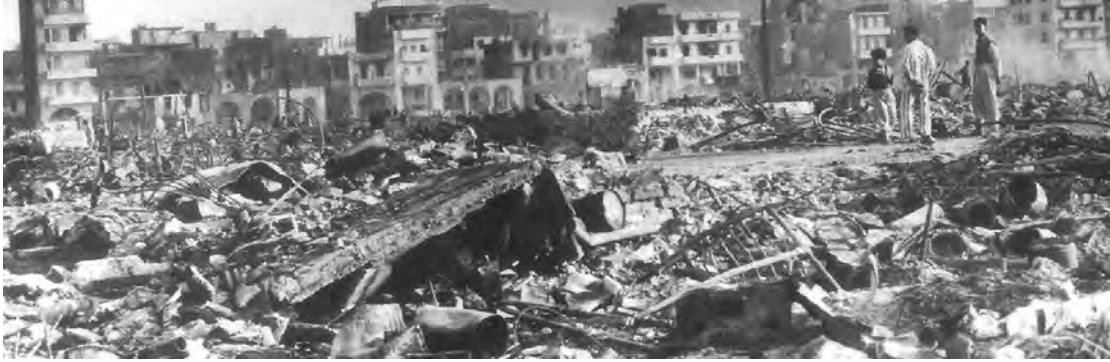
A photograph of Port Said, at the northern end of the Suez Canal, after British bombing, October 1956.

20 Look at the photograph, and then answer the questions which follow.