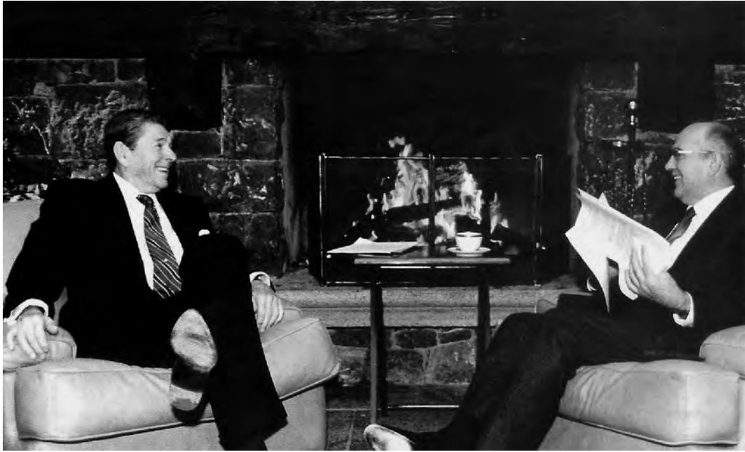
A photograph of a meeting between Reagan and Gorbachev in 1987.