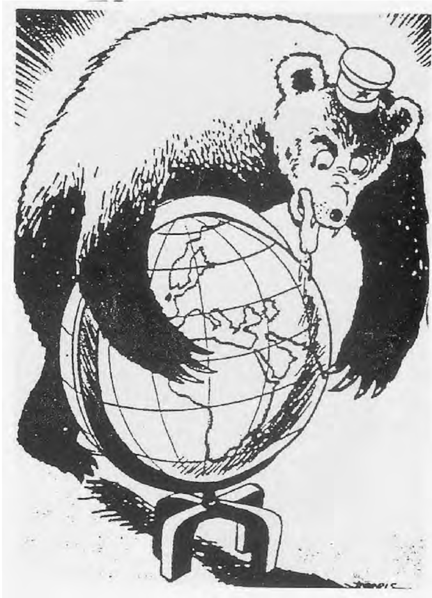
An American cartoon commenting on Stalin's expansionist ambitions.

7 Look at the cartoon, and then answer the questions which follow.