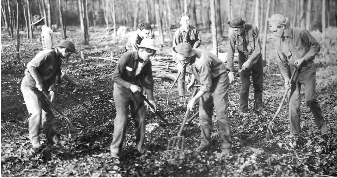
A photograph of young American men employed by the Civilian Conservation Corps (CCC) during the 1930s.

14 Look at the photograph, and then answer the questions which follow.