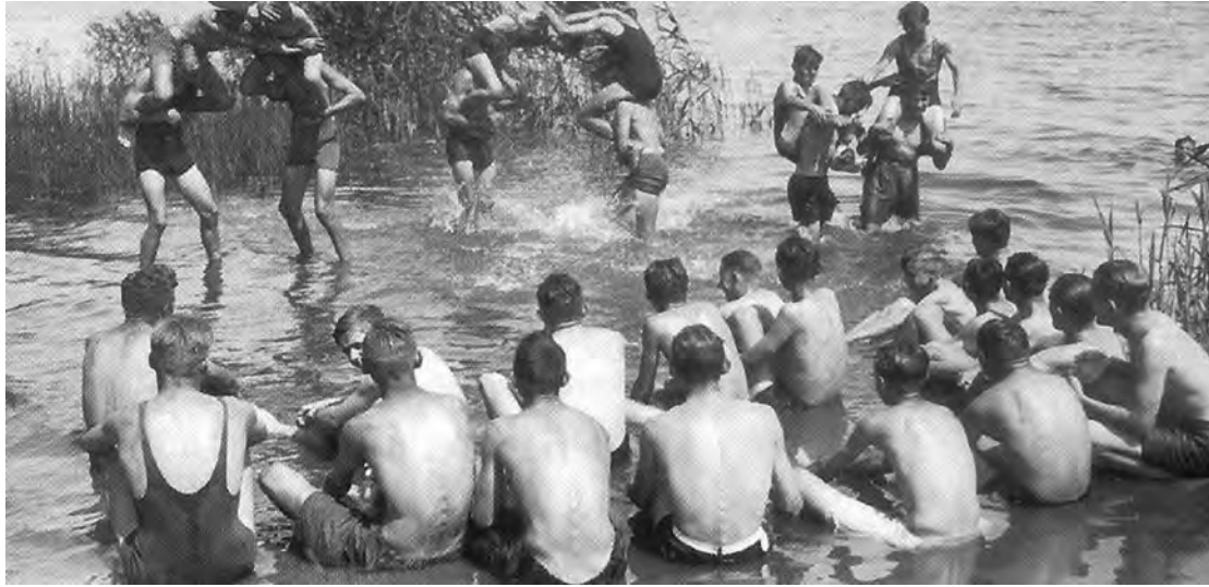
A photograph of members of the Hitler Youth, taken in the 1930s.

10 Look at the photograph, and then answer the questions which follow.