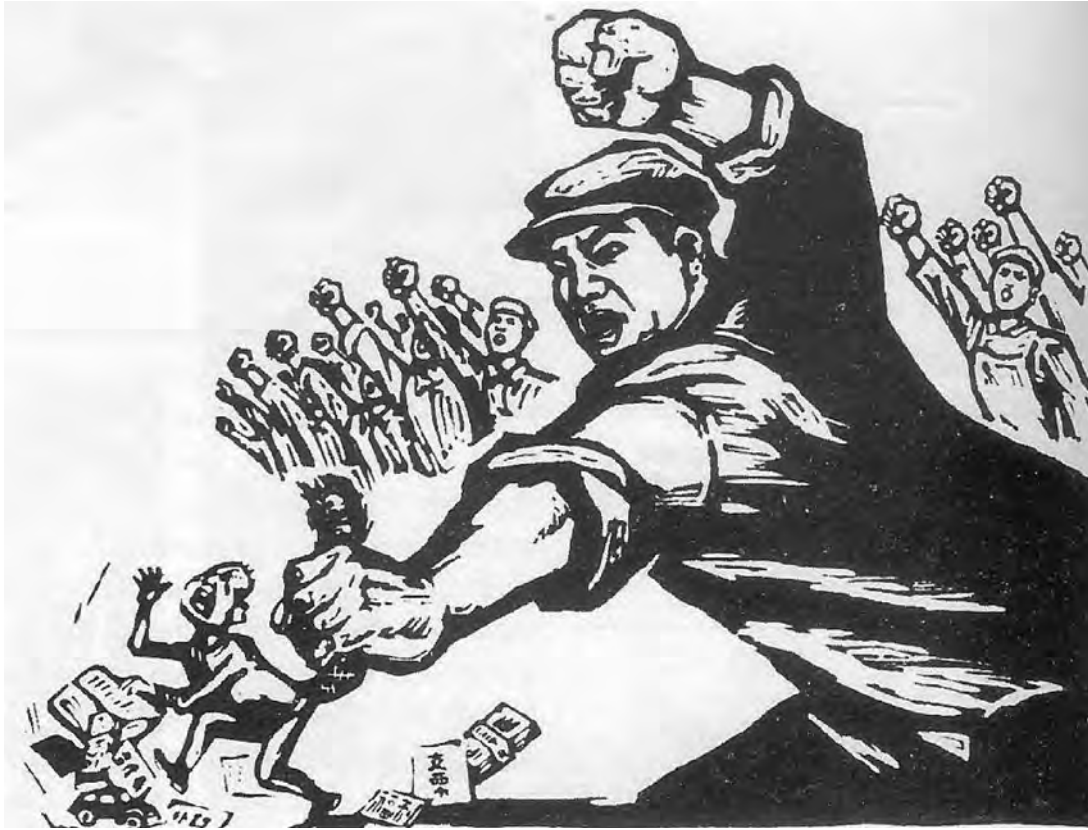
A poster published during the Cultural Revolution.

16 Look at the poster, and then answer the questions which follow.