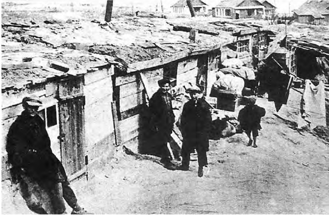
A photograph of workers' living accommodation at the Dnieper Dam site in 1931.

12 Look at the photograph, and then answer the questions which follow.