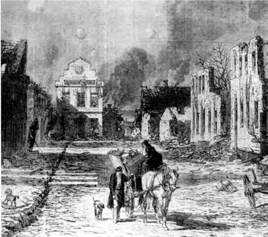
An illustration showing a Danish town in ruins after a bombardment by Prussian forces during the war of 1864.

2 Look at the illustration, and then answer the questions which follow.