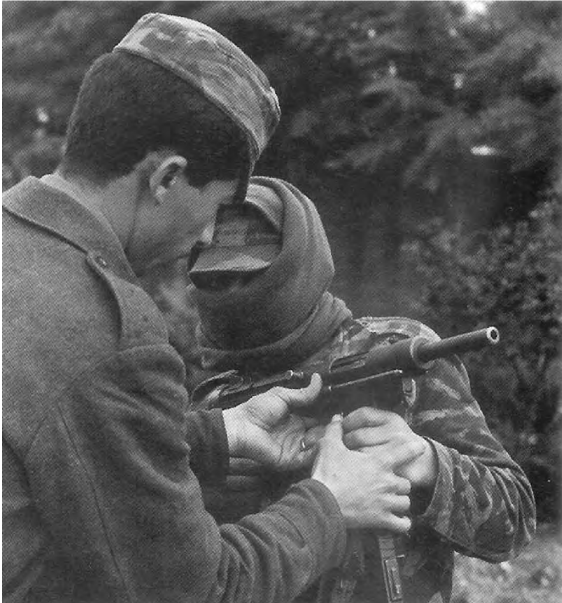
A young Fatah member receiving military training in 1966.

21 Look at the photograph, and then answer the questions which follow.