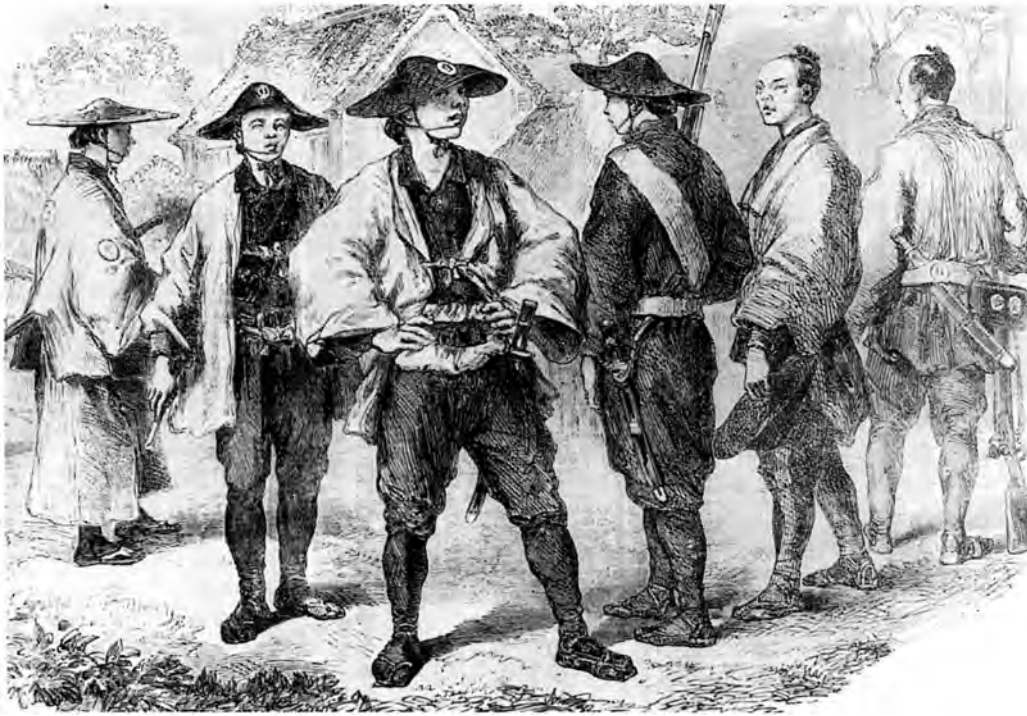
An illustration of Japanese soldiers in the 1860s in Western and traditional clothes.

4 Look at the illustration, and then answer the questions which follow.