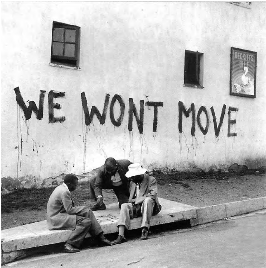
A photograph of the outside of a house in Sophiatown, 1955.

17 Look at the photograph, and then answer the questions which follow.