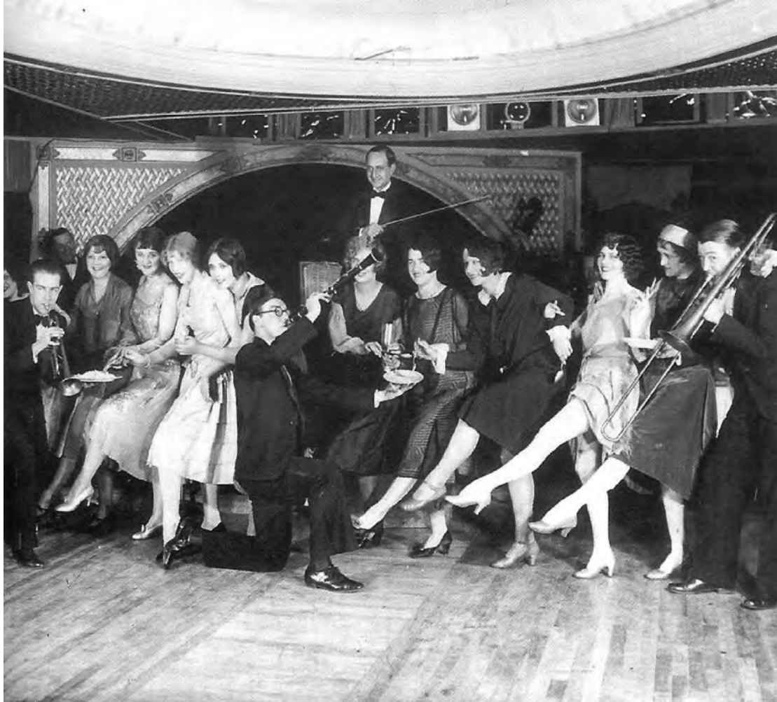
A photograph of young women dancing in 1920s America.

13 Look at the photograph, and then answer the questions which follow.