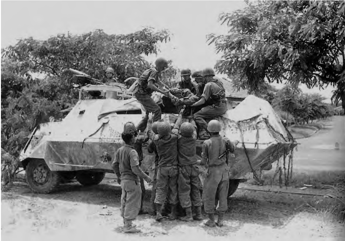
A photograph of a wounded soldier being lifted from a UN vehicle in the Congo in 1960.