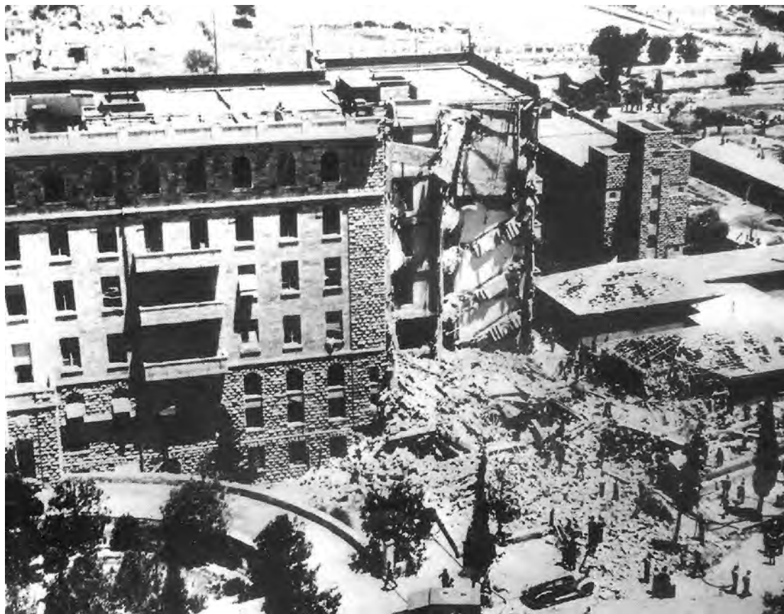
A photograph of the King David Hotel following the attack by Irgun members, July 1946.

20 Look at the photograph, and then answer the questions which follow.