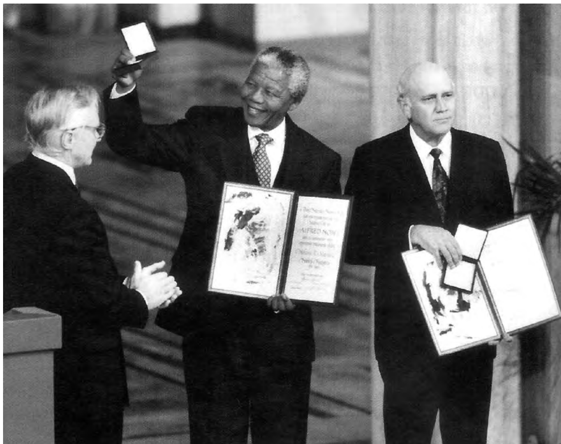
A photograph of Mandela and De Klerk receiving the Nobel Peace Prize in 1993.

18 Look at the photograph, and then answer the questions which follow.