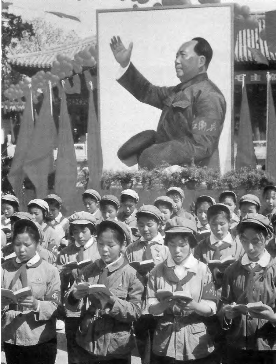
A photograph of Red Guards during the Cultural Revolution.

16 Look at the photograph, and then answer the questions which follow.