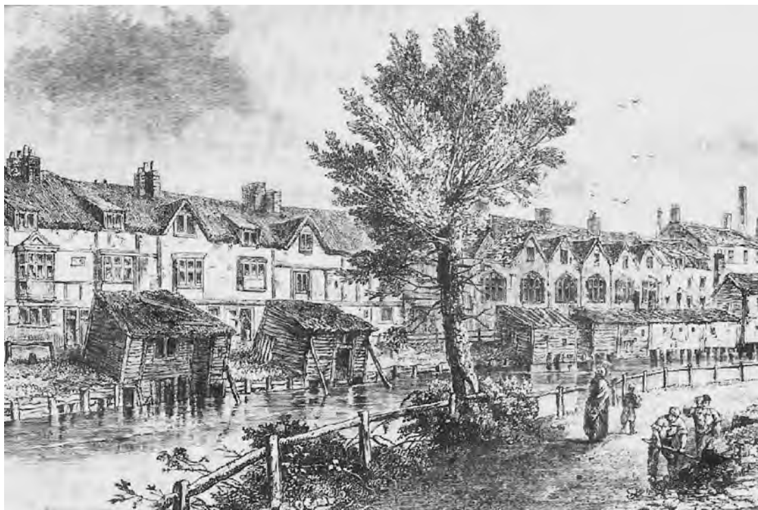
An illustration of housing in Bermondsey, London, in the mid-nineteenth century.

22 Look at the illustration, and then answer the questions which follow.