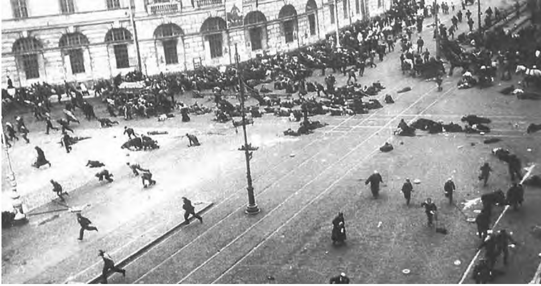
A photograph of troops firing on Bolshevik demonstrators in the streets of Petrograd, July 1917.

11 Look at the photograph, and then answer the questions which follow.