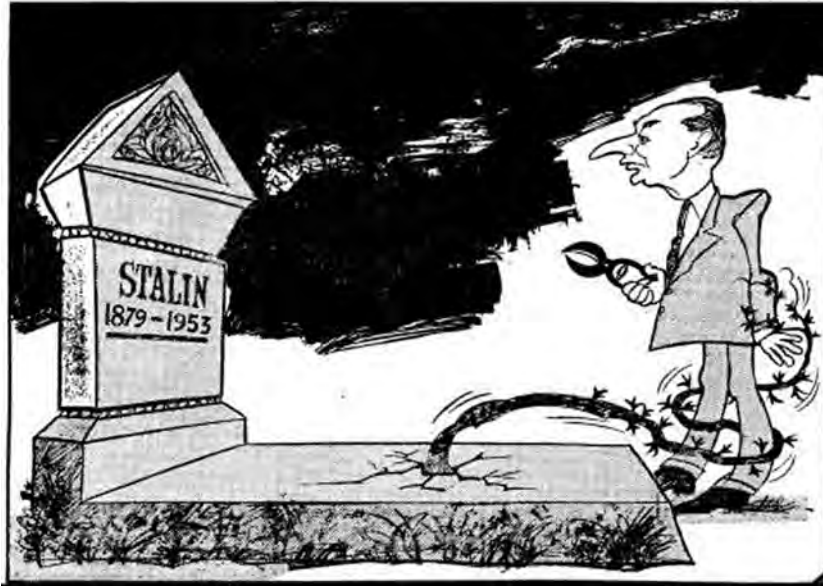
A British cartoon published on 23 July 1968. The figure on the right is Dubcek.