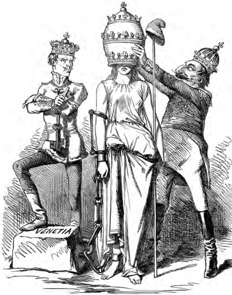
FREE ITALY (P)

A British cartoon published in July 1859. The three figures represent (from left to right) Austria, Italy and Napoleon III. Napoleon is placing the Papal crown on Italy's head.