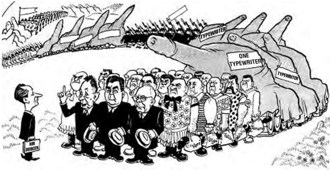
A British cartoon published on 24 July 1968. The leading figures facing Dubcek are Kosygin and Brezhnev. They are saying to Dubcek 'Of course, Mr Dubcek, we've had to bring a few lady secretaries and some tea boys.'