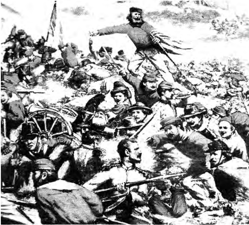
An illustration of Garibaldi in the battle of Calatafimi, published shortly after the battle in 1860.