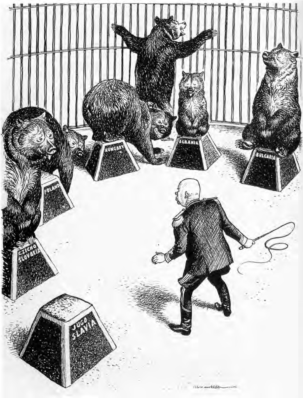
A cartoon from a British magazine, October 1956. The ringmaster is Khrushchev.