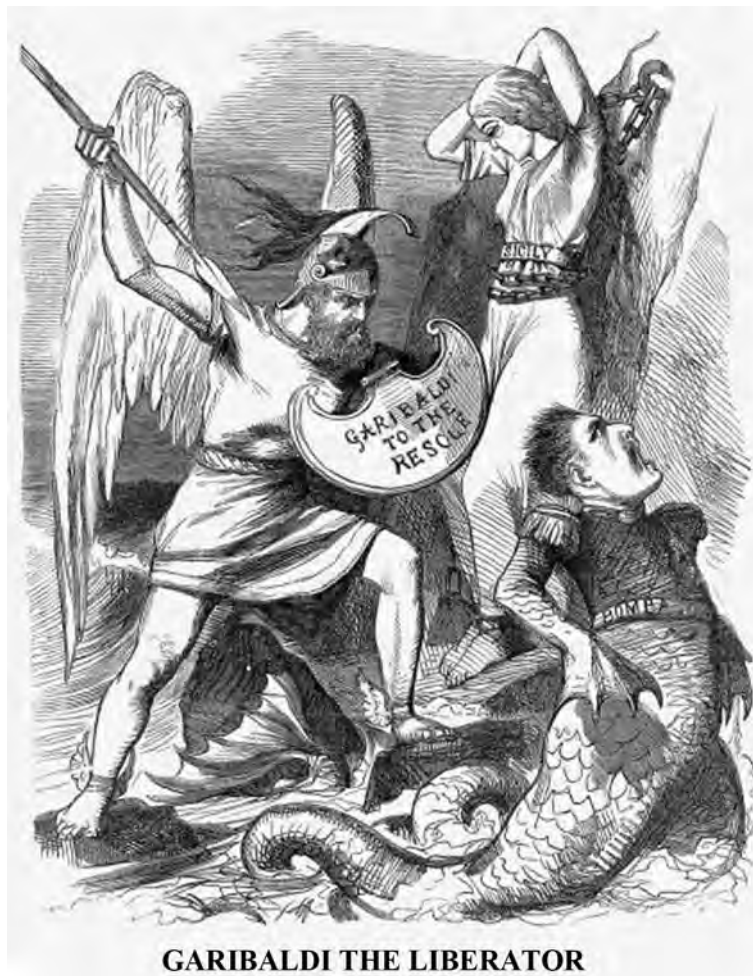
A British cartoon published on 16 June 1860. The sea monster represents the Bourbon monarchy.