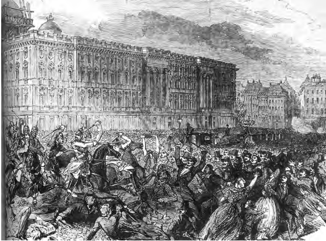
A contemporary engraving of events in Berlin, 1848.