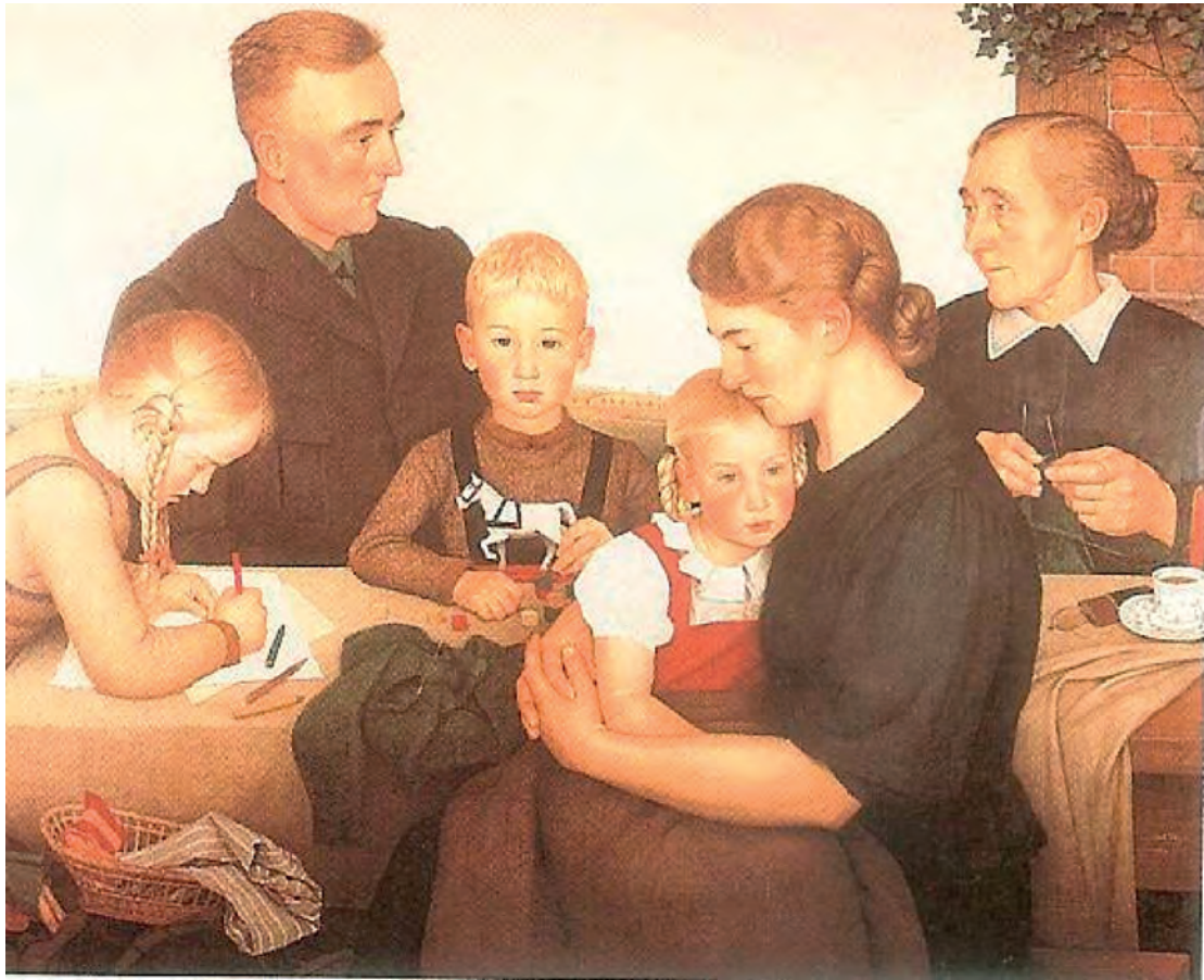
A painting showing a German family, 1939.

10 Look at the painting, and then answer the questions which follow.