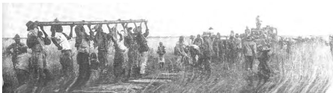
A photograph showing the construction of the Otavi Railway across Herero land in 1903.

19 Look at the photograph, and then answer the questions which follow.