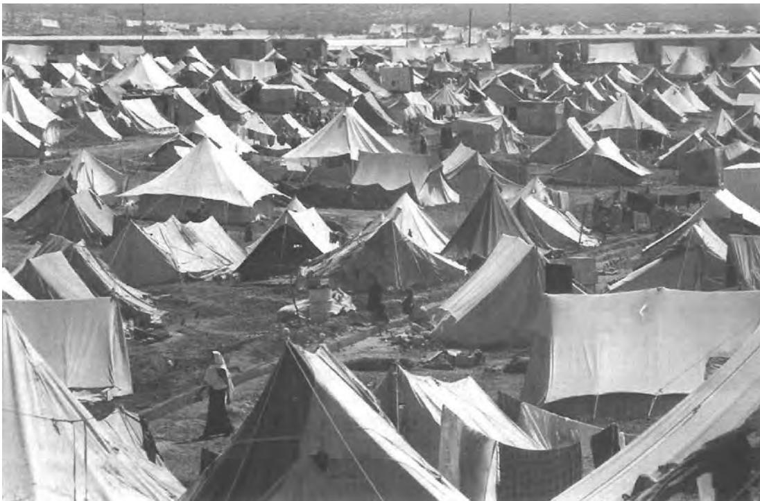
A photograph of a Palestinian refugee camp in Jordan in 1949.

21 Look at the photograph, and then answer the questions which follow.