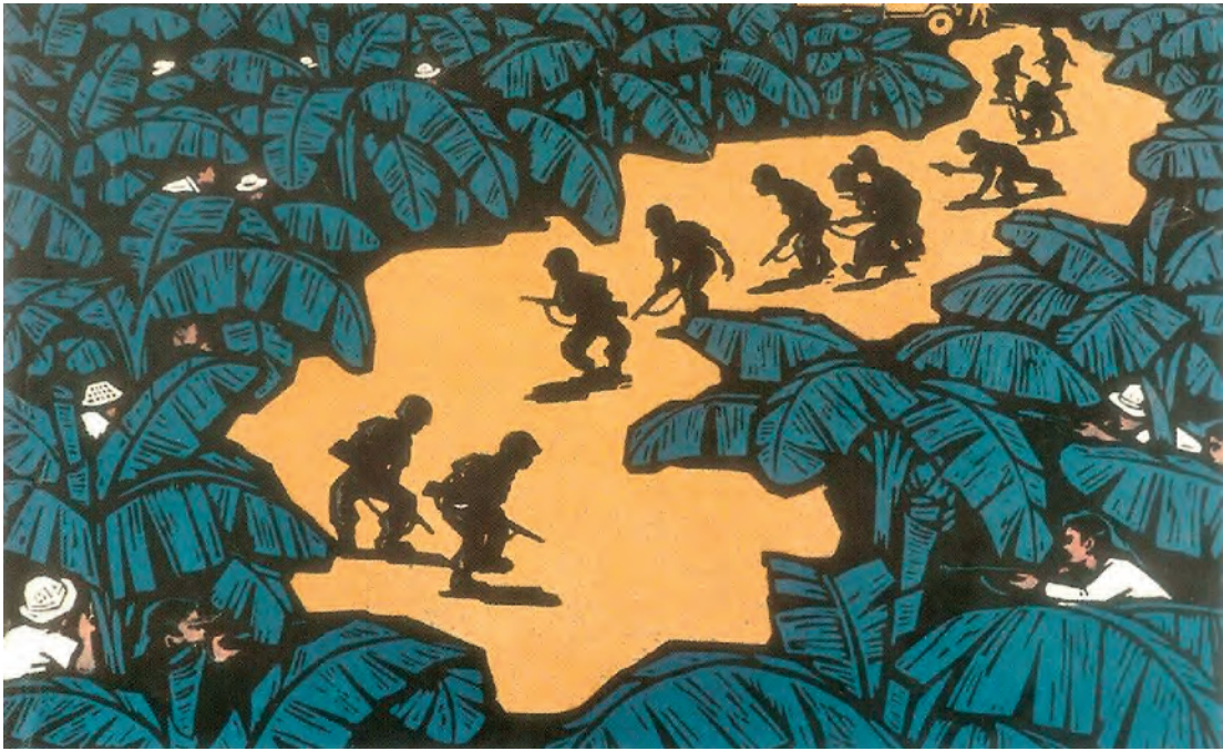
A Vietcong poster.