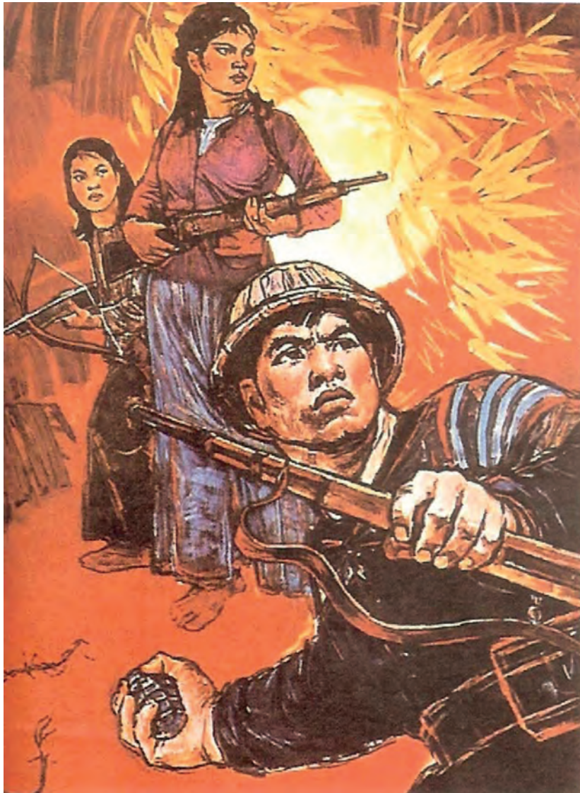
US Imperialism, Get out of South Viet Nam.

7 Look at the poster, and then answer the questions which follow.