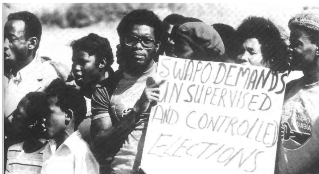
A photograph of Namibian demonstrators at the time of the elections organised by the South Africans in December 1978.

19 Look at the photograph, and then answer the questions which follow.