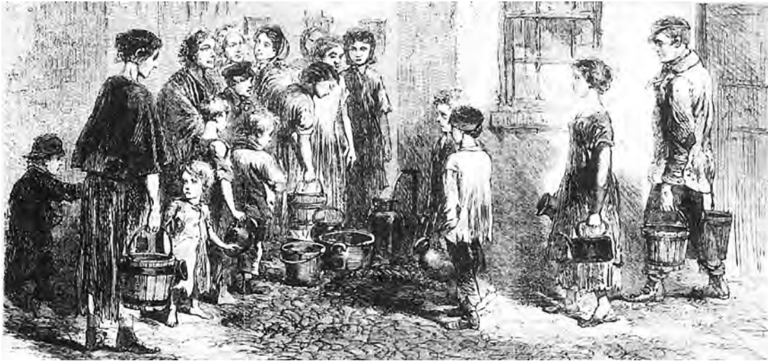
An engraving from 1862 showing daily life in an industrial town.

22 Look at the illustration, and then answer the questions which follow.