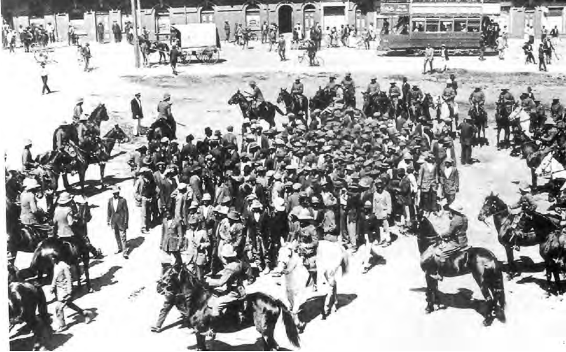
A photograph of anti-pass demonstrators in Johannesburg in 1919. All the people in the crowd are under arrest.

18 Look at the photograph, and then answer the questions which follow.