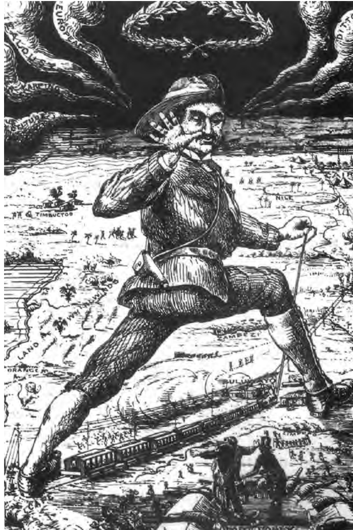
THE AMBITIONS OF CECIL RHODES

17 Look at the cartoon, and then answer the questions which follow.