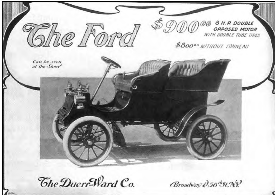
An advertisement for an early Model T Ford.

13 Look at the advertisement, and then answer the questions which follow.