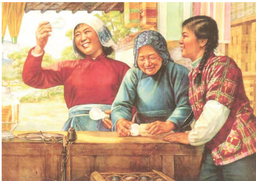
A poster entitled 'Electricity reaches our village', published in 1965.

16 Look at the poster, and then answer the questions which follow.