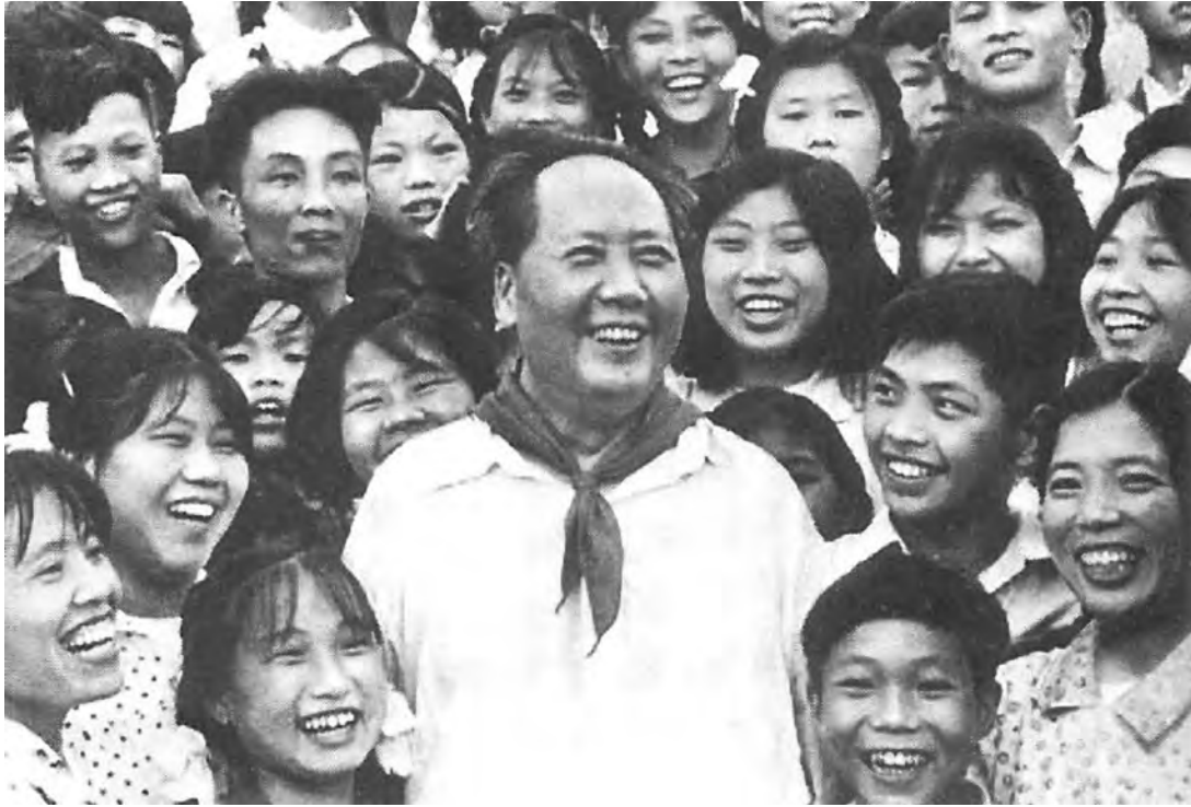
A photograph of Mao with young supporters.

16 Look at the photograph, and then answer the questions which follow.