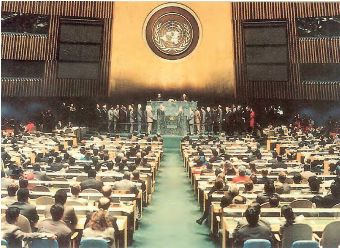
A photograph of the UNO General Assembly in session.

8 Look at the photograph, and then answer the questions which follow.