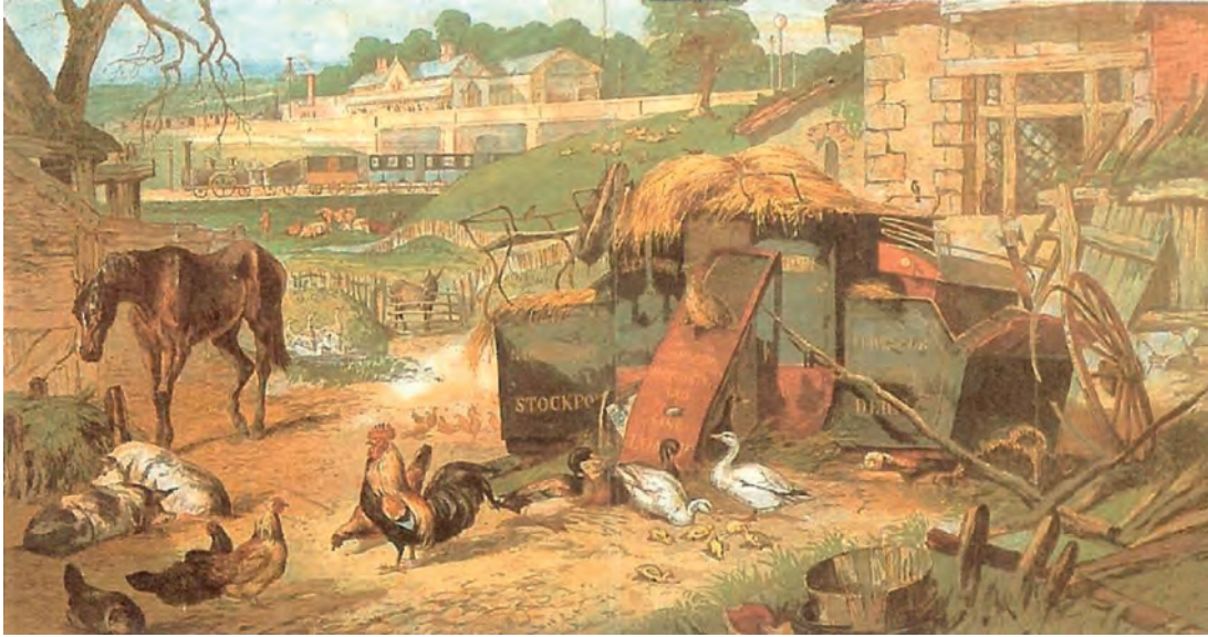
A painting from 1845 of a countryside scene.

22 Look at the painting, and then answer the questions which follow.