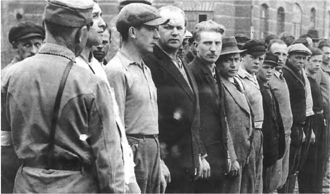
A photograph of political prisoners at the Oranienburg concentration camp near Berlin.

10 Look at the photograph, and then answer the questions which follow.