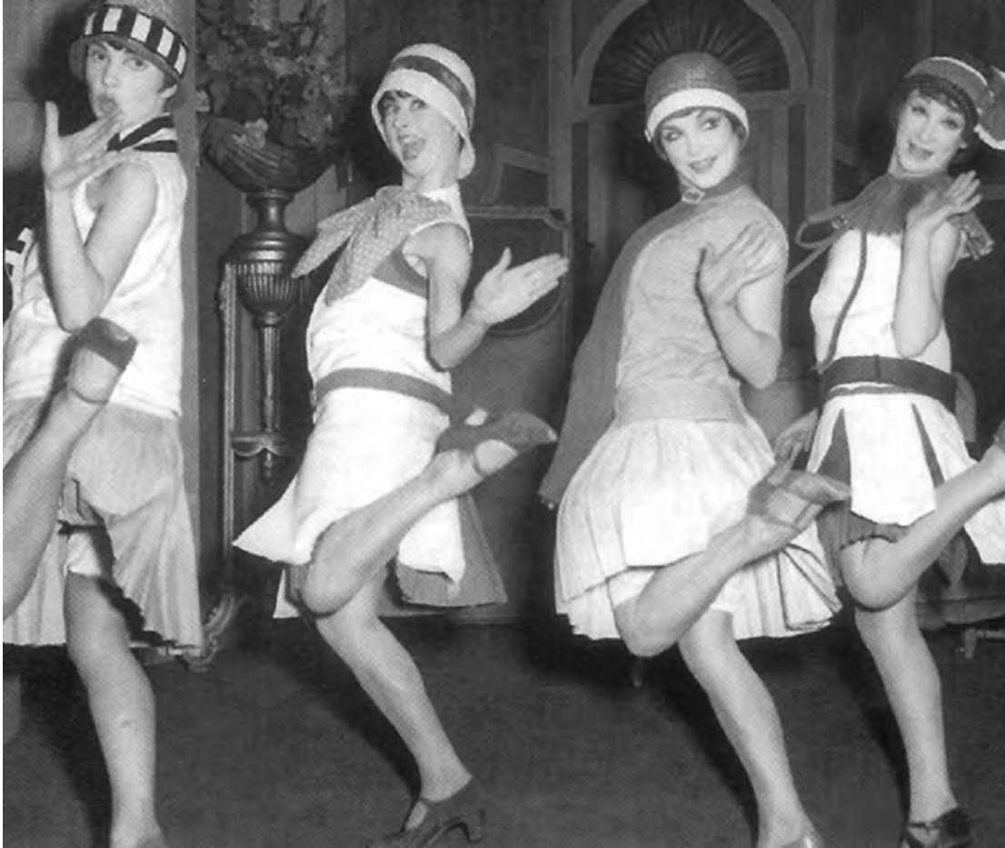
A photograph of flappers dancing in the 1920s.

13 Look at the photograph, and then answer the questions which follow.