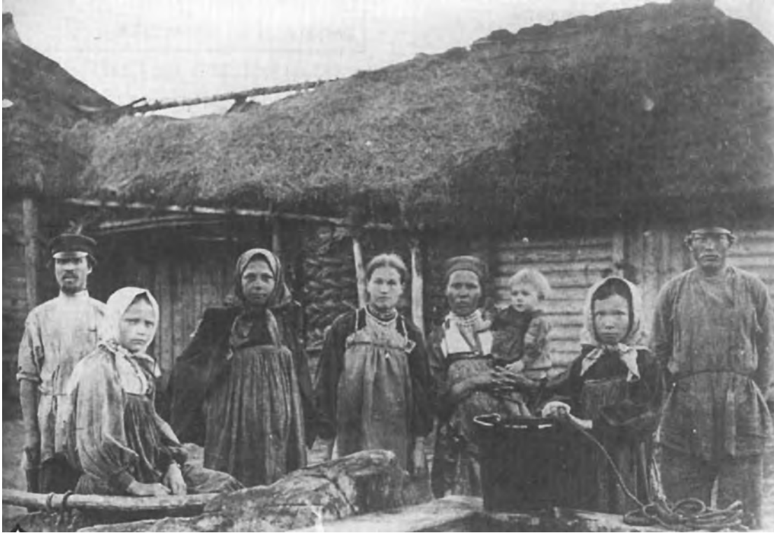
A photograph of a Russian peasant family outside their home in the early-twentieth century.

11 Look at the photograph, and then answer the questions which follow.