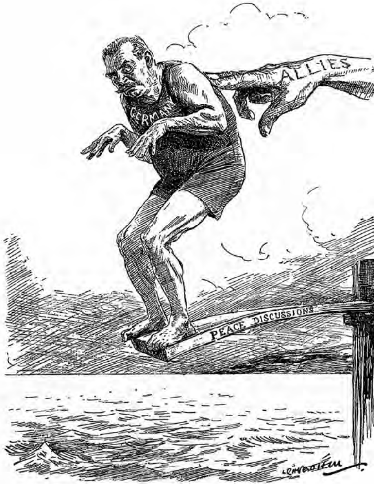
THE FINISHING TOUCH.