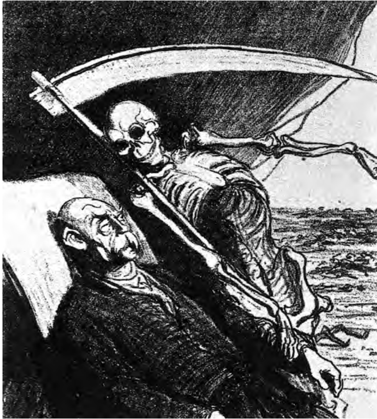
A cartoon from the early 1870s showing Death thanking Bismarck for the thousands killed in the course of unification.