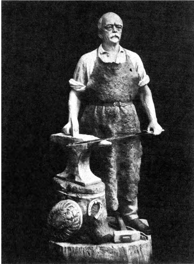
A statue of Bismarck from the 1870s. It shows him making preparations for the unification of Germany.