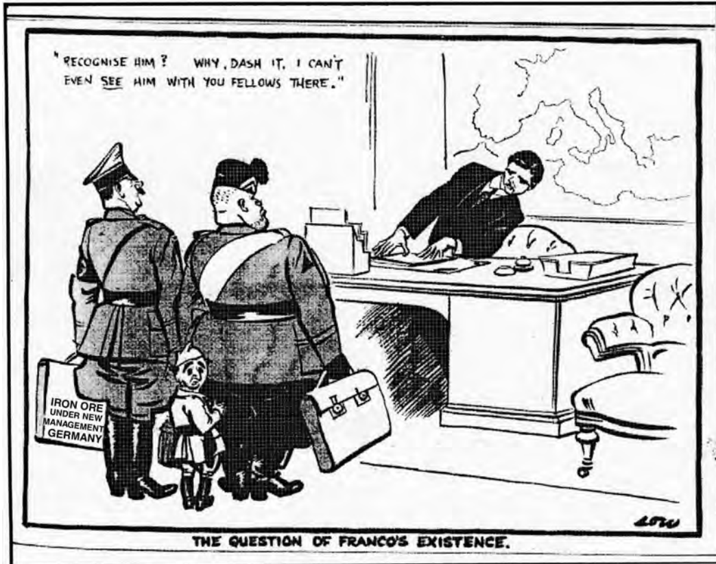
A cartoon published in Britain in July 1937. The figure behind the desk represents the British Government.