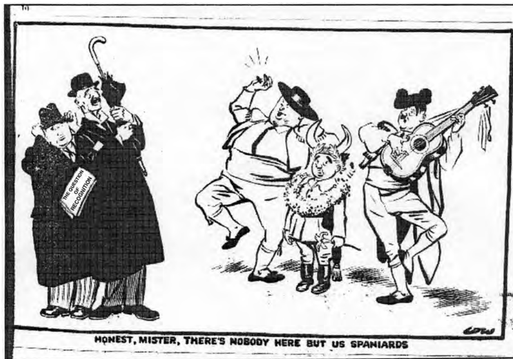
A cartoon published in Britain in February 1939. The figures on the left represent the British and French Governments. The figures on the right are Mussolini, Franco and Hitler.