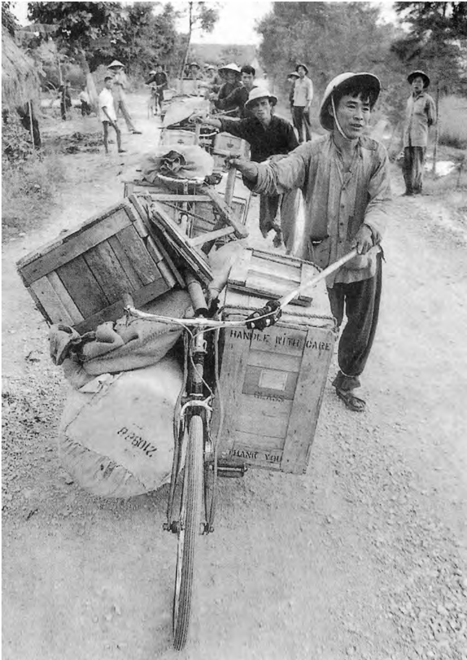
A Vietcong supply convoy.

7 Study the photograph, and then answer the questions which follow.