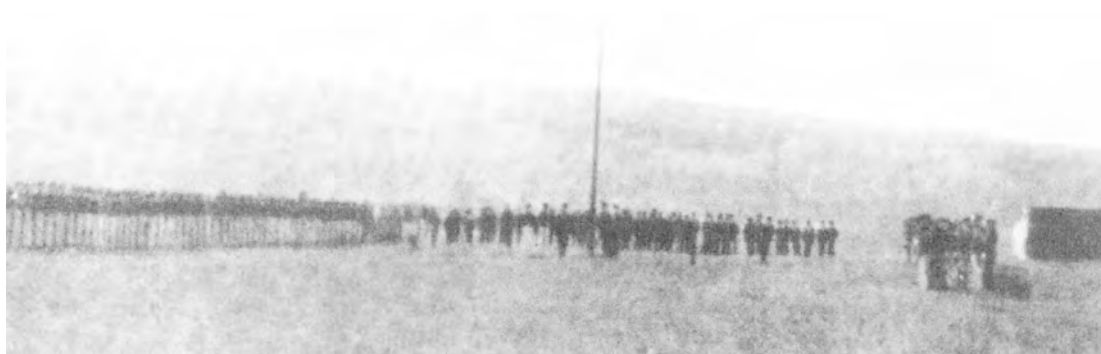
Hoisting the German flag at Angra Pequena, August 1884.

19 Study the photograph, and then answer the questions which follow.