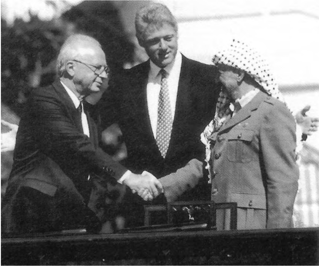
Rabin and Arafat shake hands while US President Clinton looks on, 1993.

20 Study the photograph, and then answer the questions which follow.