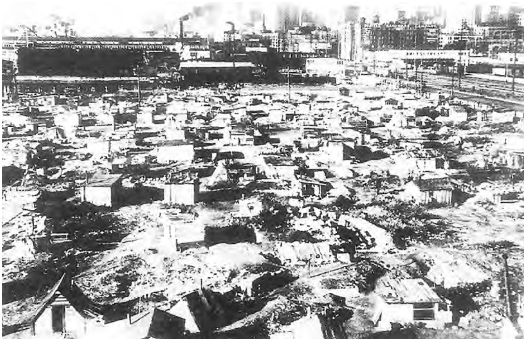
A Hooverville shanty town on wasteland in Seattle, Washington.

14 Study the photograph, and then answer the questions which follow.