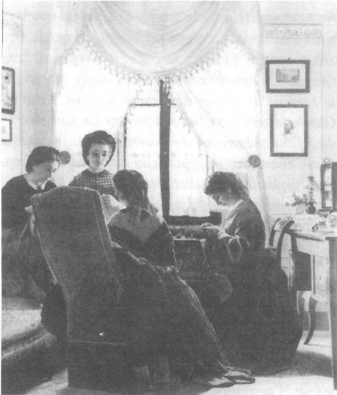
A picture entitled 'The Sewing of Red Shirts' showing women preparing shirts for volunteers in Garibaldi's army.

2 Study the picture, and then answer the questions which follow.