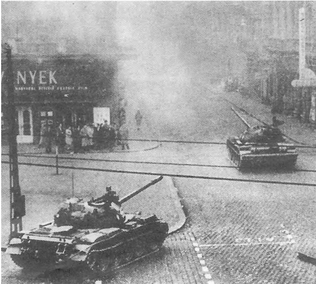
Soviet tanks in the centre of Budapest, November 1956.

8 Study the photograph, and then answer the questions which follow.