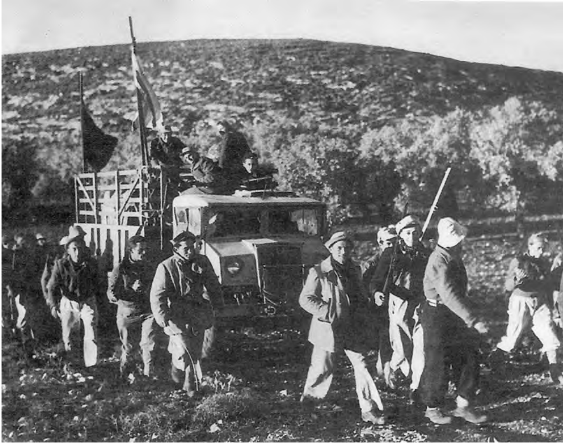
Jewish immigrants arriving in 1949 to build settlements on Palestinian land.

21 Study the photograph, and then answer the questions which follow.