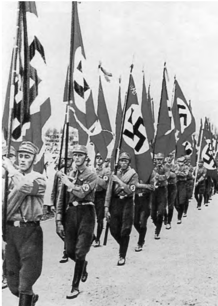
The SA parading at Nuremberg in 1933.