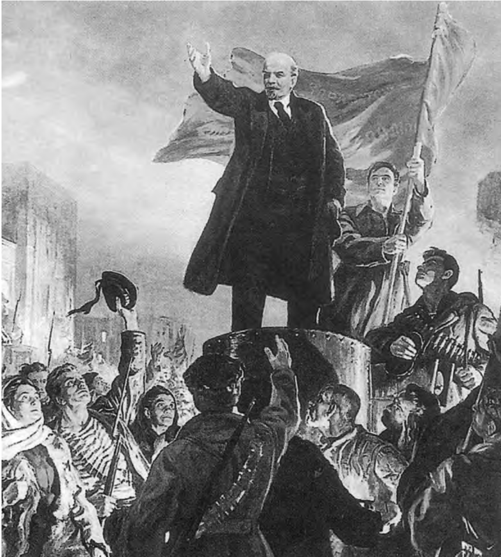
A painting of Lenin addressing a crowd on his return to Petrograd in April 1917.

11 Study the painting, and then answer the questions which follow.