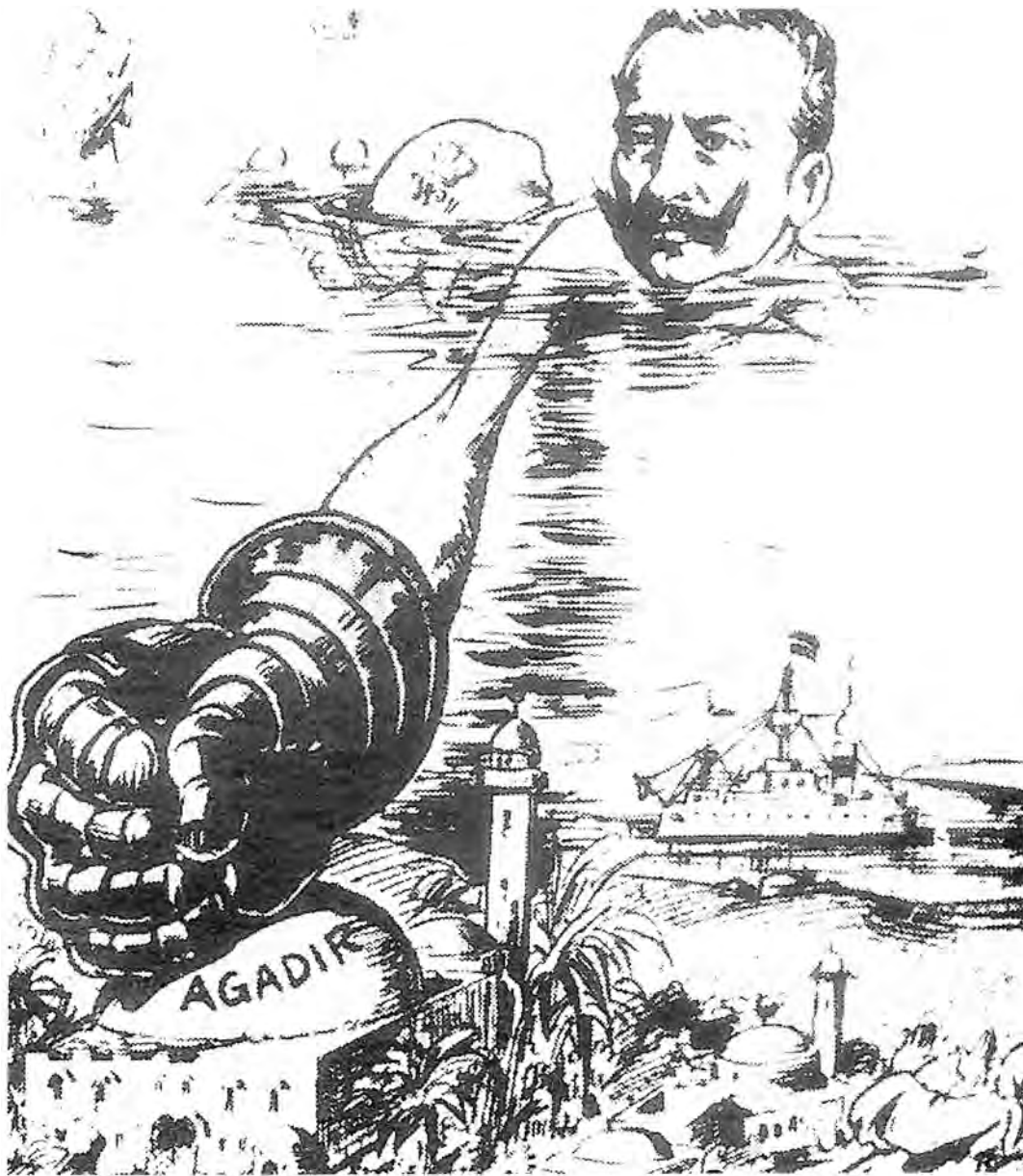
A cartoon about the Agadir crisis, published in 1911.

4 Study the cartoon, and then answer the questions which follow.