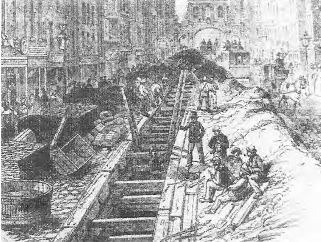
Building a sewer in London in 1844.

23 Study the illustration, and then answer the questions which follow.