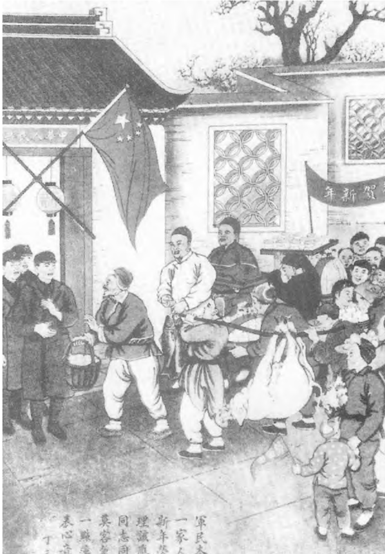
A Chinese poster published in 1950. It is showing happy relations between peasants and the People's Liberation Army.

15 Study the picture, and then answer the questions which follow.