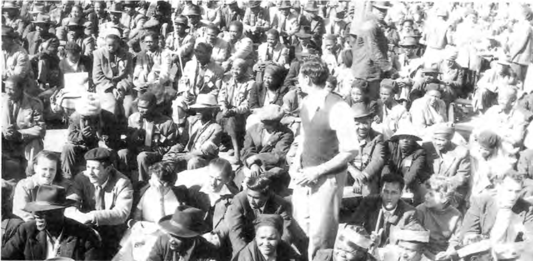
Some of the crowd at the Congress held at Kliptown, June 1955, when the Freedom Charter was signed.

18 Study the photograph, and then answer the questions which follow.