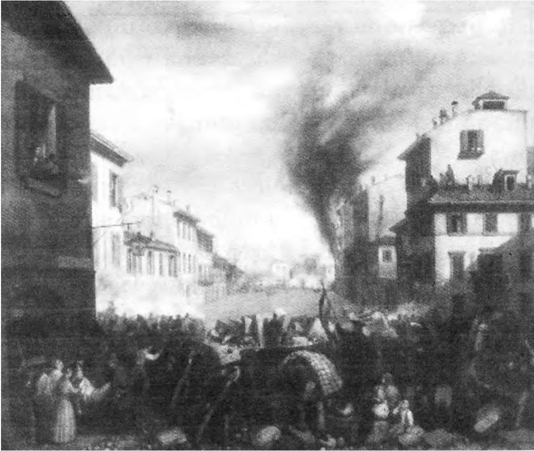
A street battle in the Milan uprising, March 1848.

2 Study the picture, and then answer the questions which follow.