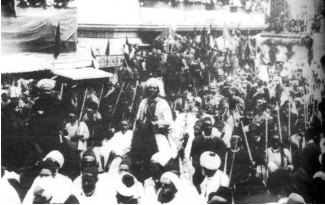
Kaiser Wilhelm's soldiers riding through the streets of Tangier in 1905.