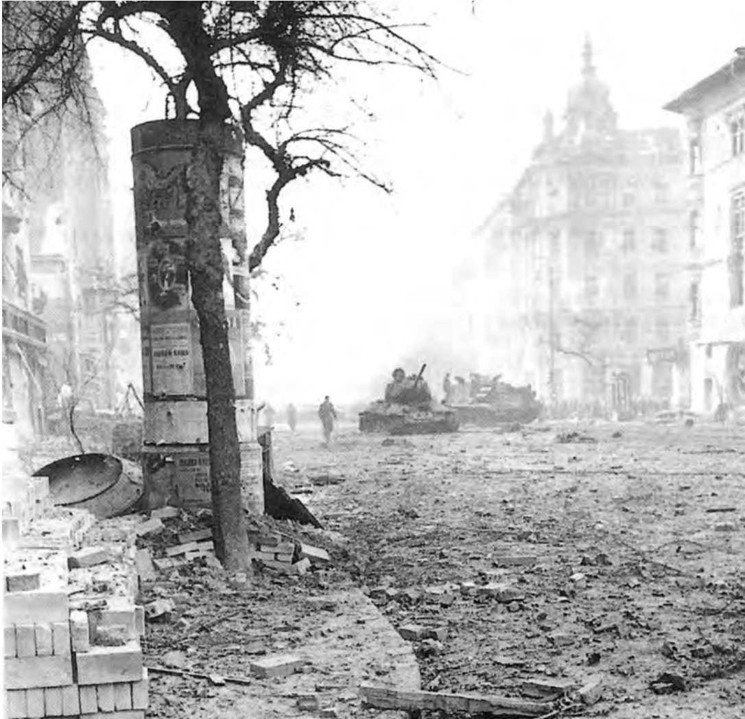
A street scene in Budapest, October 1956.

8 Study the photograph, and then answer the questions which follow.