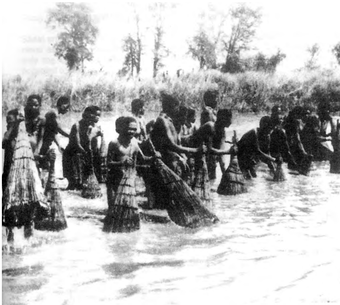
A photograph showing Namibians fishing. It was taken in the late-nineteenth century.

19 Study the photograph, and then answer the questions which follow.