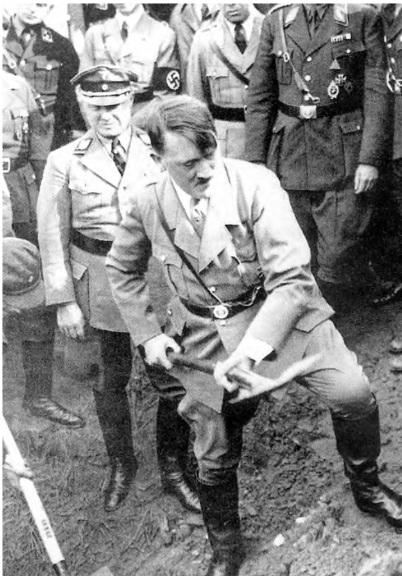
Hitler starts the construction of the first autobahn, 1933.

10 Study the photograph, and then answer the questions which follow.