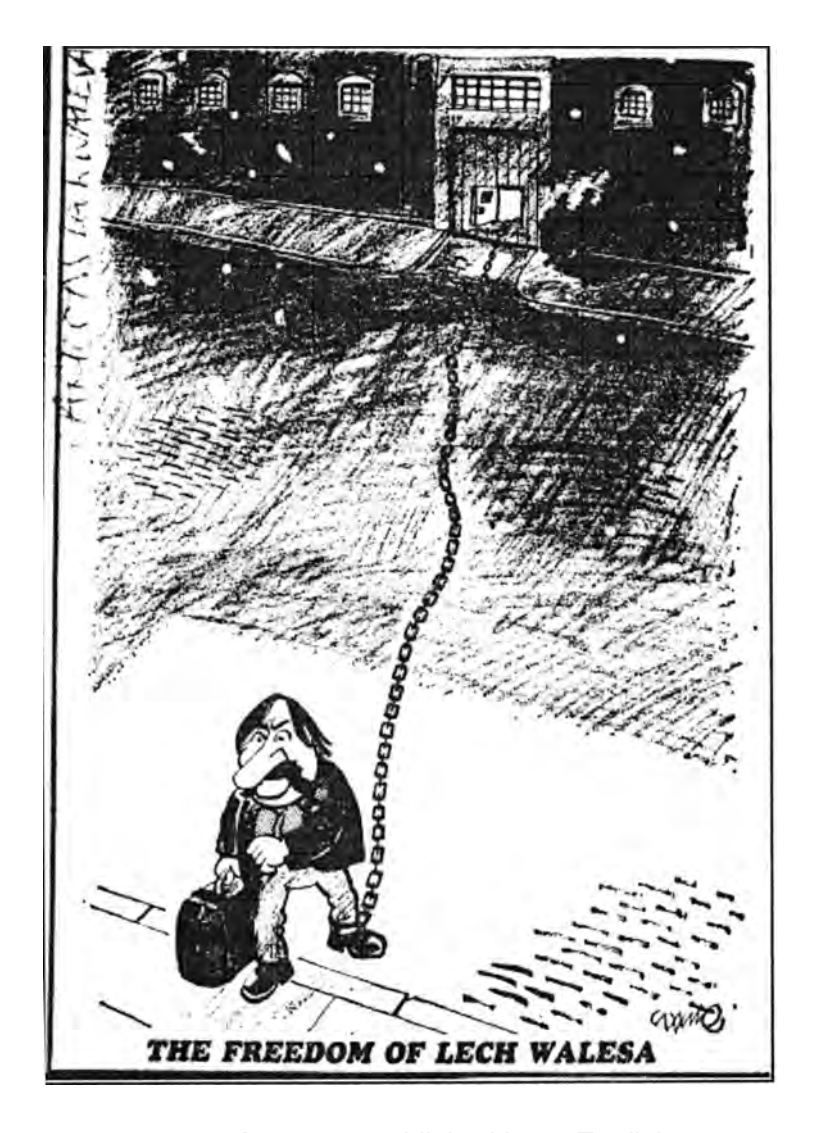
A cartoon published in an English newspaper in November 1982.