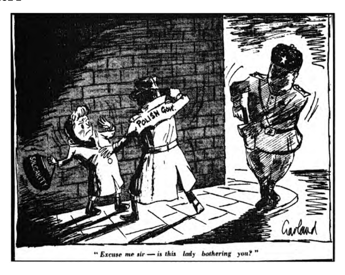
A cartoon published in an English newspaper in December 1980. The Russian soldier is saying 'Excuse me sir - is this lady bothering you?'.