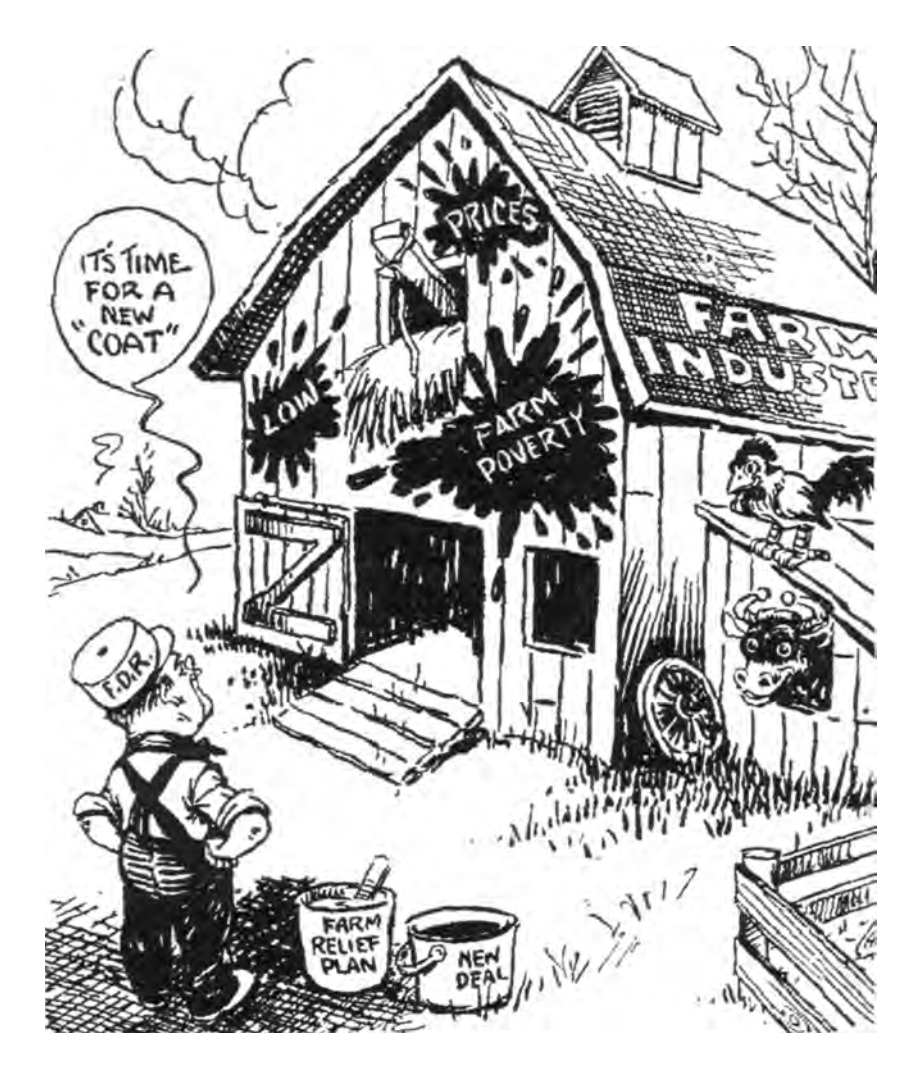
From a New York State newspaper, 1933.