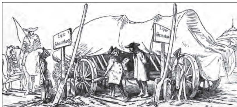
A German cartoon showing the collection of customs duties in 1834.