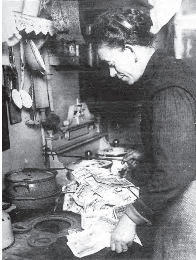
A woman using banknotes to start her fire in 1923.