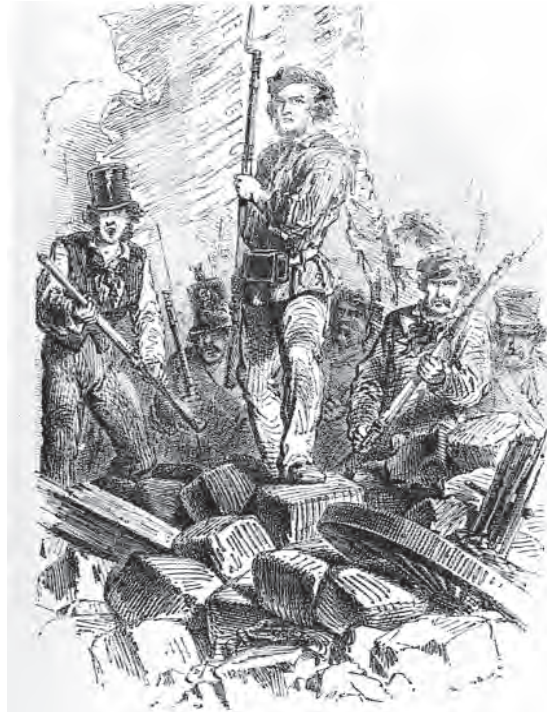
Paris during the 'June Days', 1848.