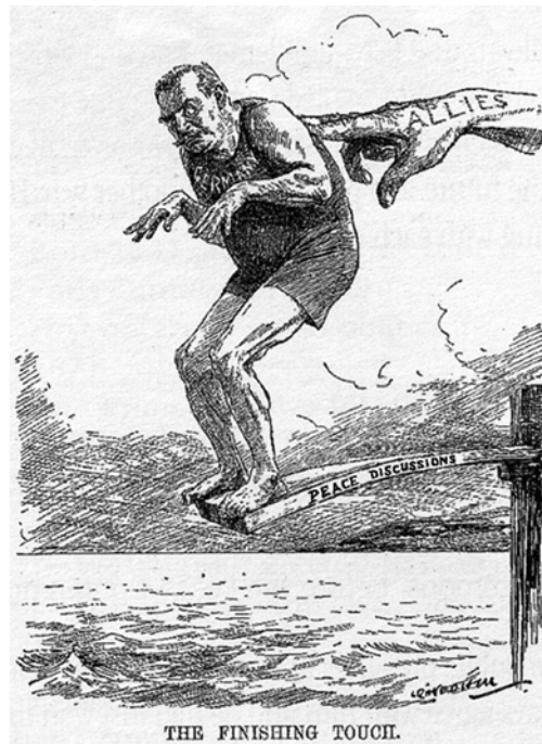
A cartoon published in Britain in 1919.