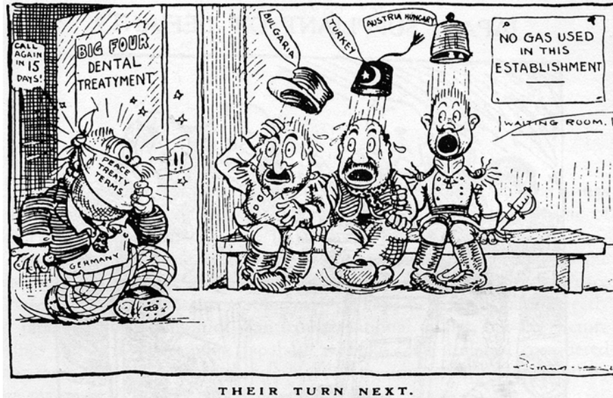
A cartoon from a British newspaper, May 1919. It shows the waiting room of a dentist.