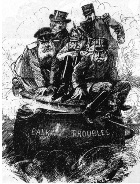
A British cartoon entitled 'The Boiling Point', published in 1912. The figures represent the five Great Powers.