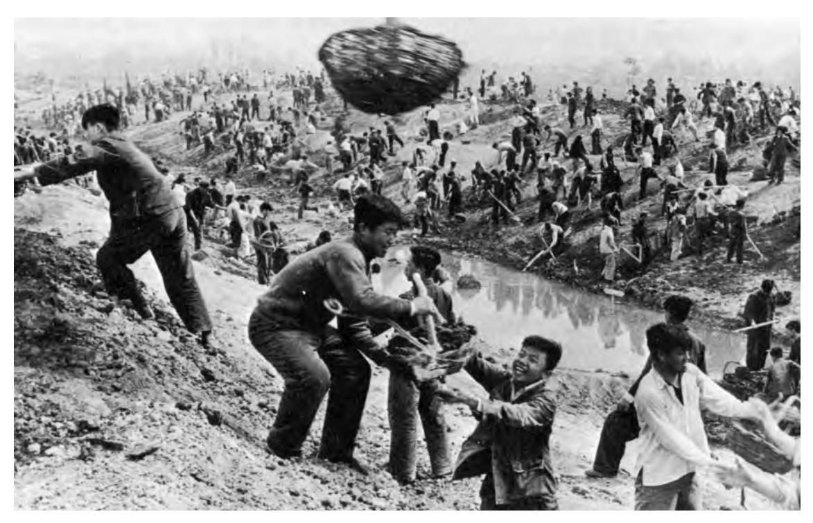
Building a new canal near Beijing during the Great Leap Forward.