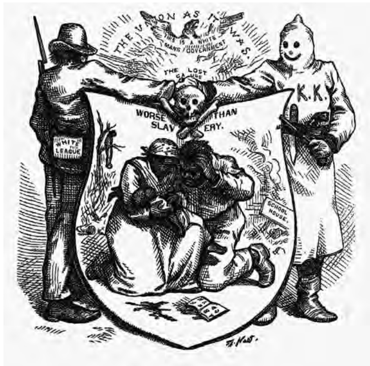
A cartoon from an American magazine published in 1874. The cartoon is called 'Worse than Slavery'.