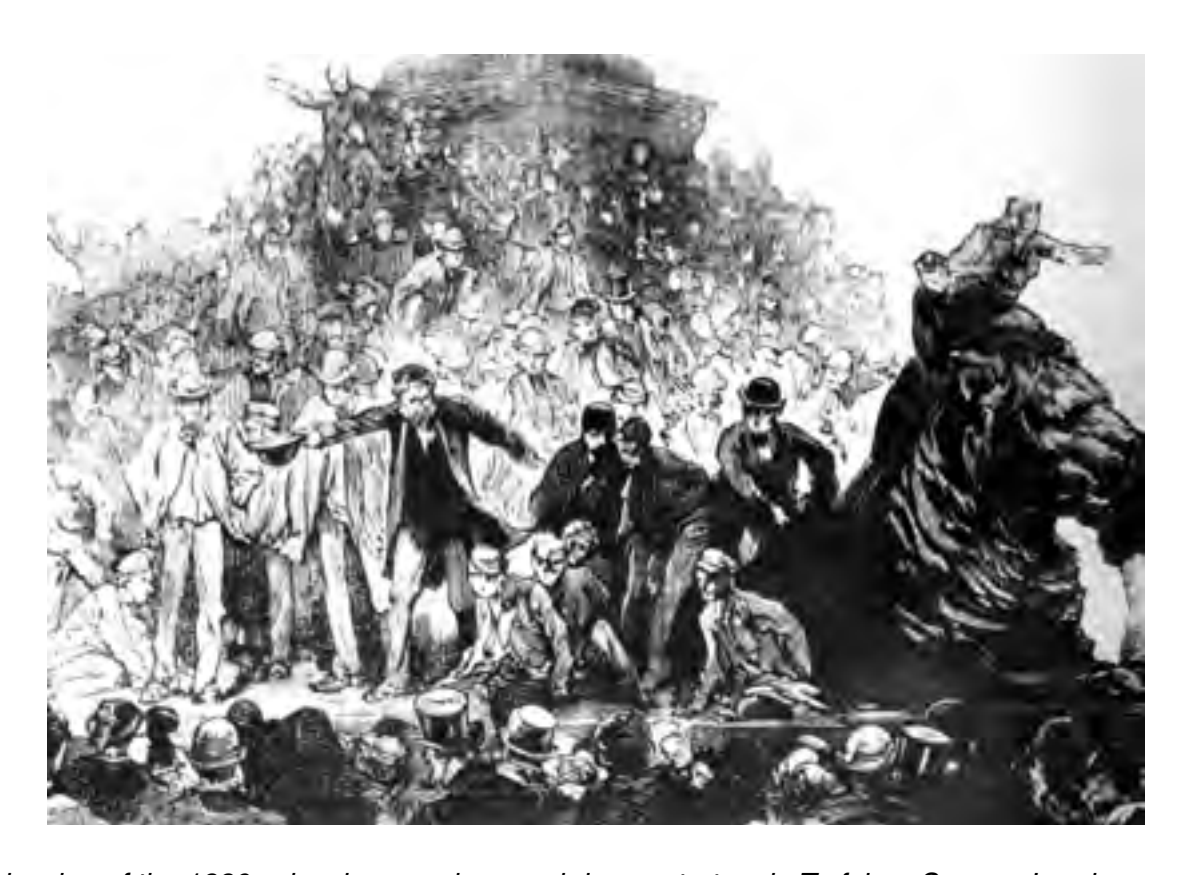
A drawing of the 1880s showing speakers and demonstrators in Trafalgar Square, London, as police break up a march protesting about unemployment.