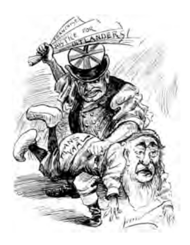
A cartoon from a British newspaper, 1899.