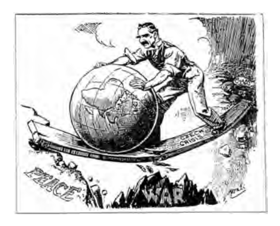
A cartoon published in a British newspaper on 25 September 1938.