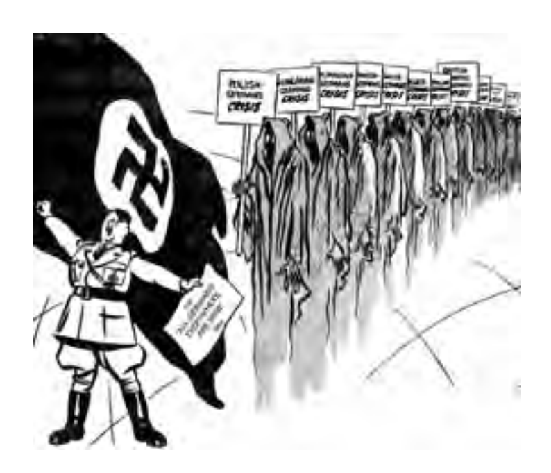
A cartoon titled 'Nightmare Waiting List'. It was published in a British newspaper on 9 September 1938.