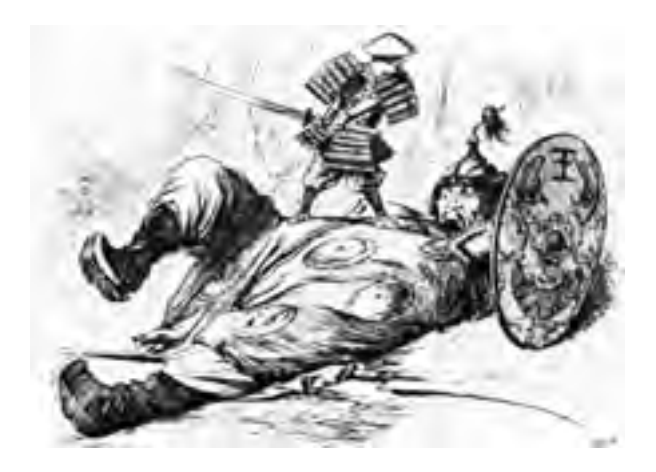
A cartoon published in a British magazine in 1895. It shows a Japanese soldier on top of a Chinese soldier.