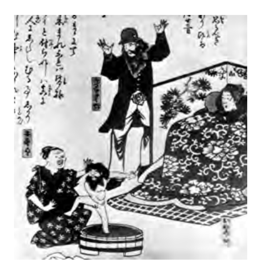
A Japanese drawing from the second half of the nineteenth century showing what would happen if Japanese women married Western men. The child is the result of the marriage.