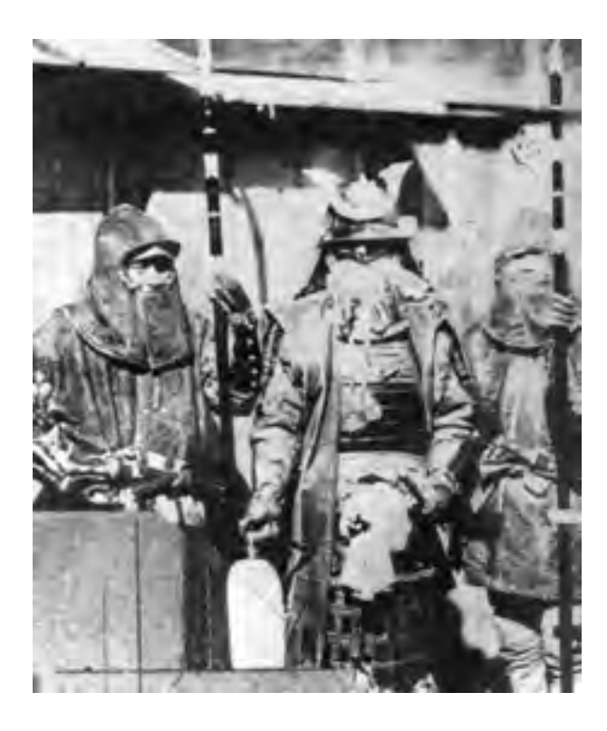
A photograph of Japanese warriors in 1868.