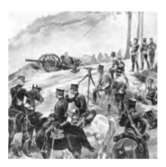
A drawing of Japanese soldiers in 1904.