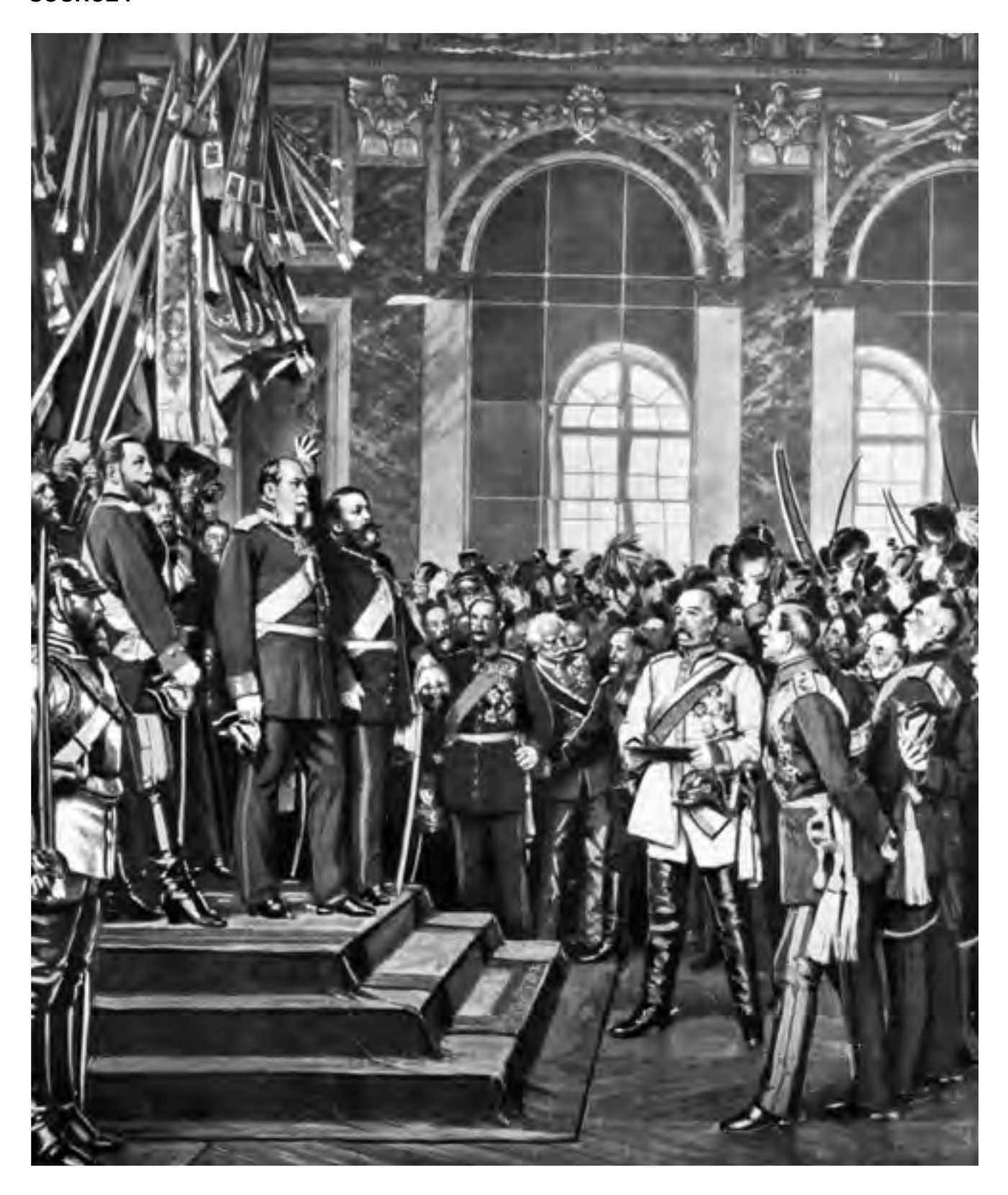
A painting entitled 'The Proclamation of the German Empire'. This is the third version of this painting and was painted in 1885 to celebrate Bismarck's seventieth birthday. The original version was painted in 1871 and showed the occasion as dull, with Bismarck in a less important position. In this version, the artist has placed Bismarck at the centre (in white).