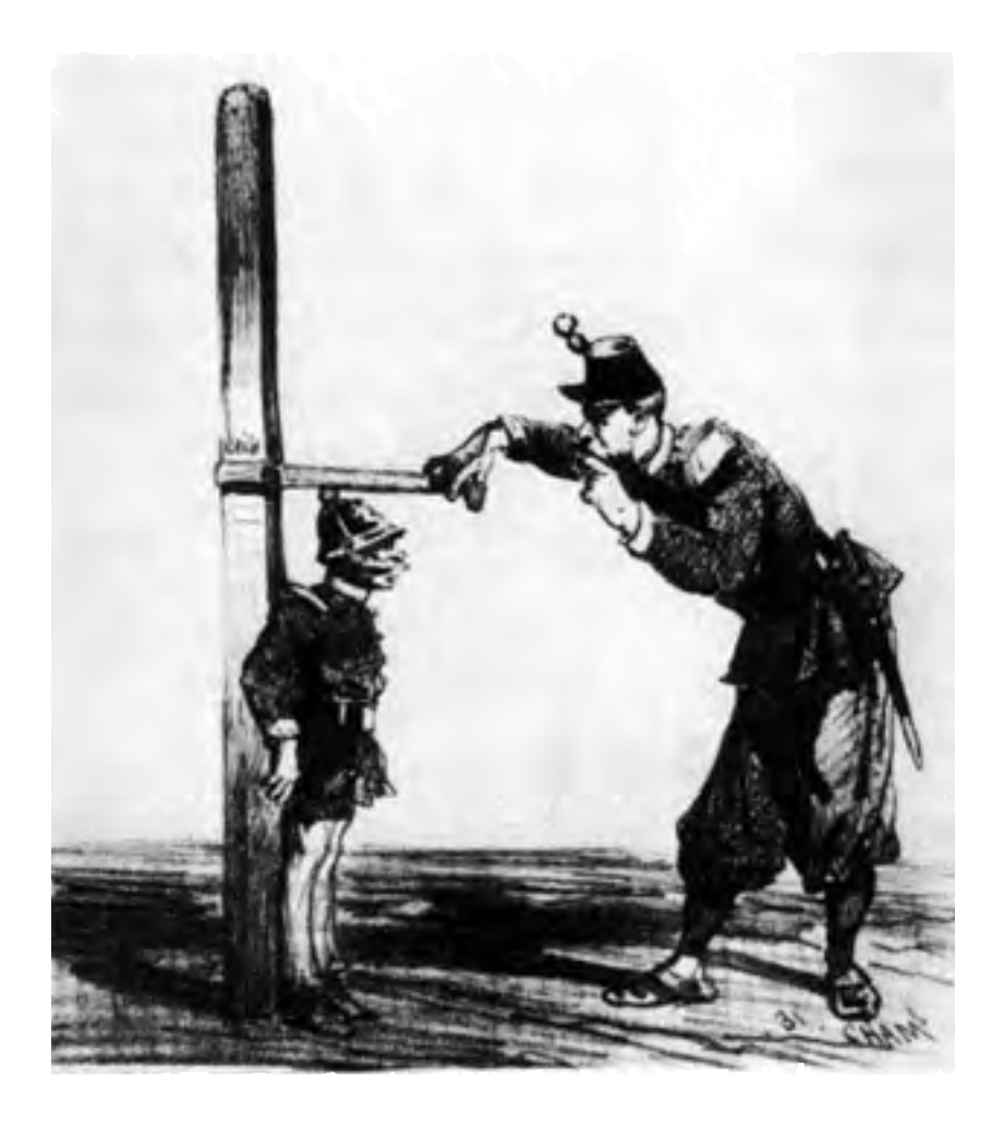
A British cartoon published in 1867. France is saying to Prussia: 'Now you are big enough. You must not get any bigger. I'm telling you this for your health.'