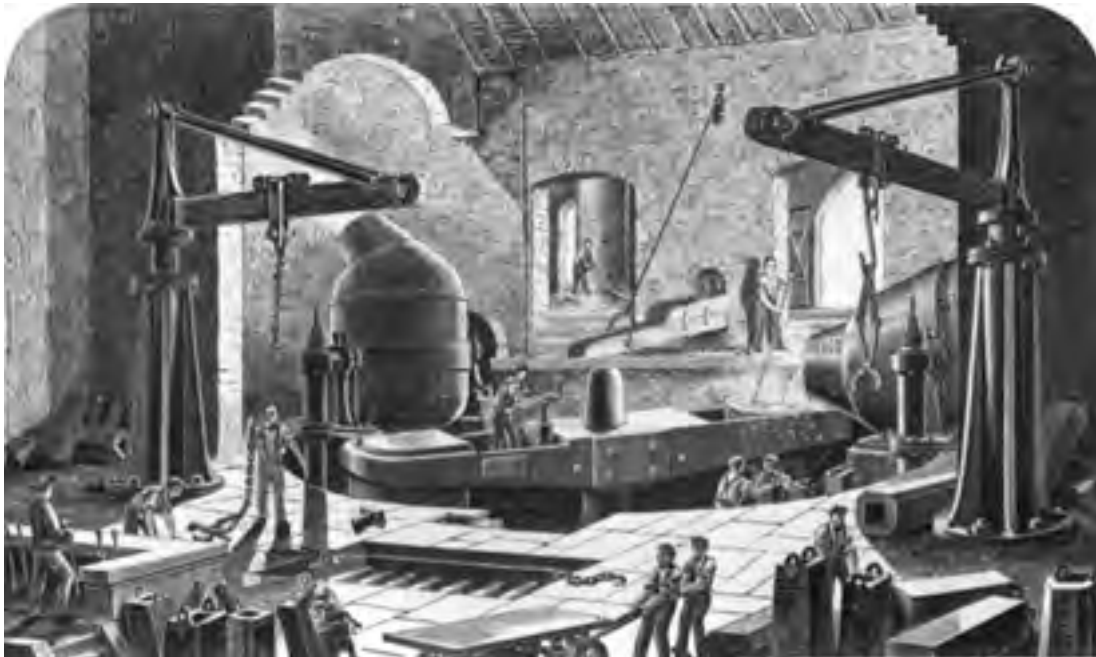
A Bessemer steel factory.

23 Study the picture, and then answer the questions which follow.