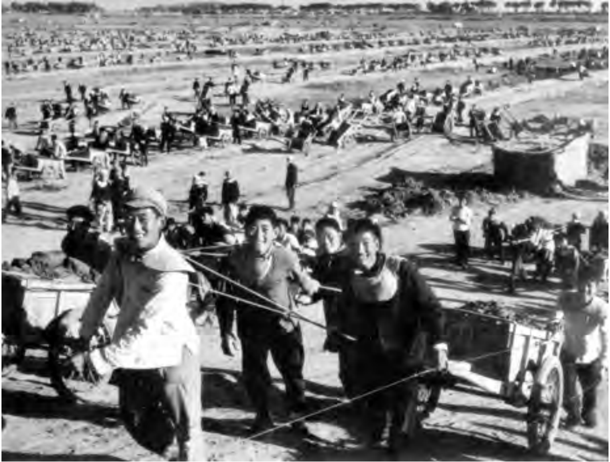
Chinese workers on the Haiho River Project.

15 Study the photograph, and then answer the questions which follow.