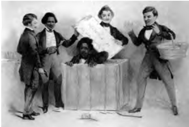
The escape of a slave from Richmond, Virginia to Philadelphia in the North.