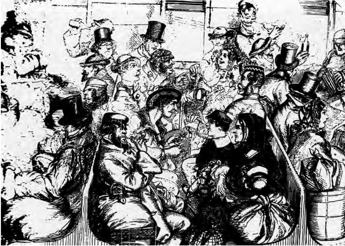
Sketch made in 1859 of a Parliamentary train from London to the Midlands.