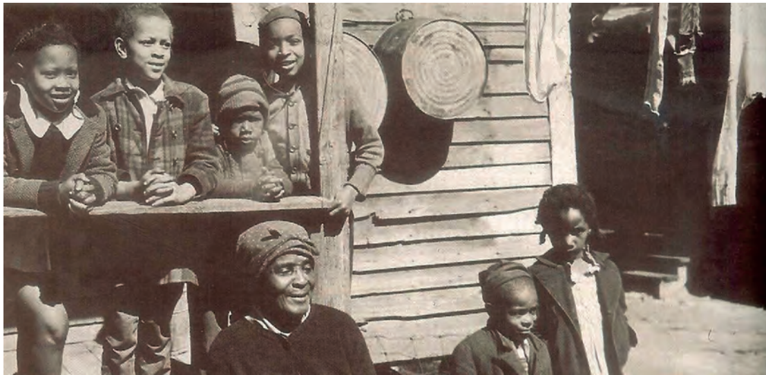
A photograph of a black family at home in the southern state of Virginia, during the 1920s.

13 Look at the photograph, and then answer the questions which follow.