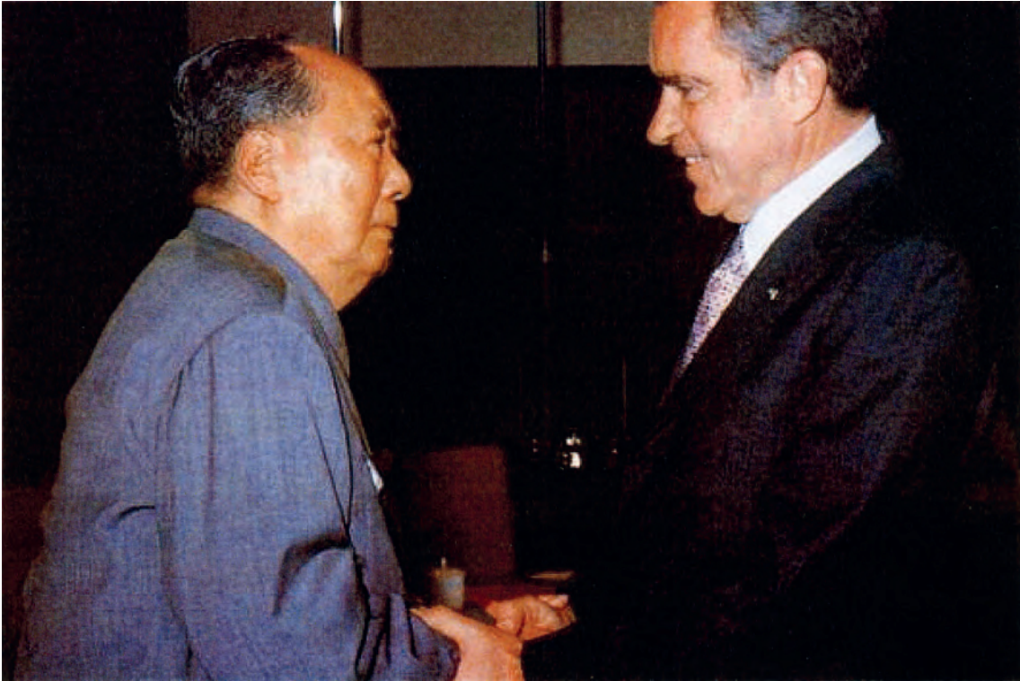
A photograph of Mao meeting with US President Nixon in 1972.

16 Look at the photograph, and then answer the questions which follow.