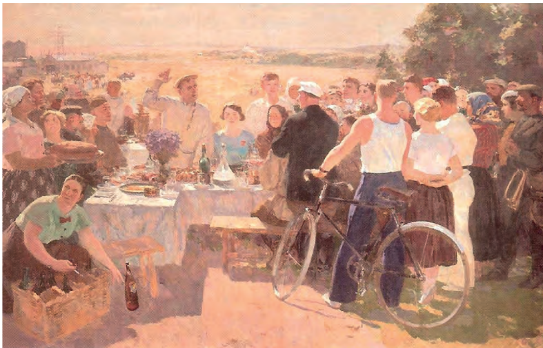
A Soviet painting from 1937, showing life on a collective farm.

12 Look at the painting, and then answer the questions which follow.