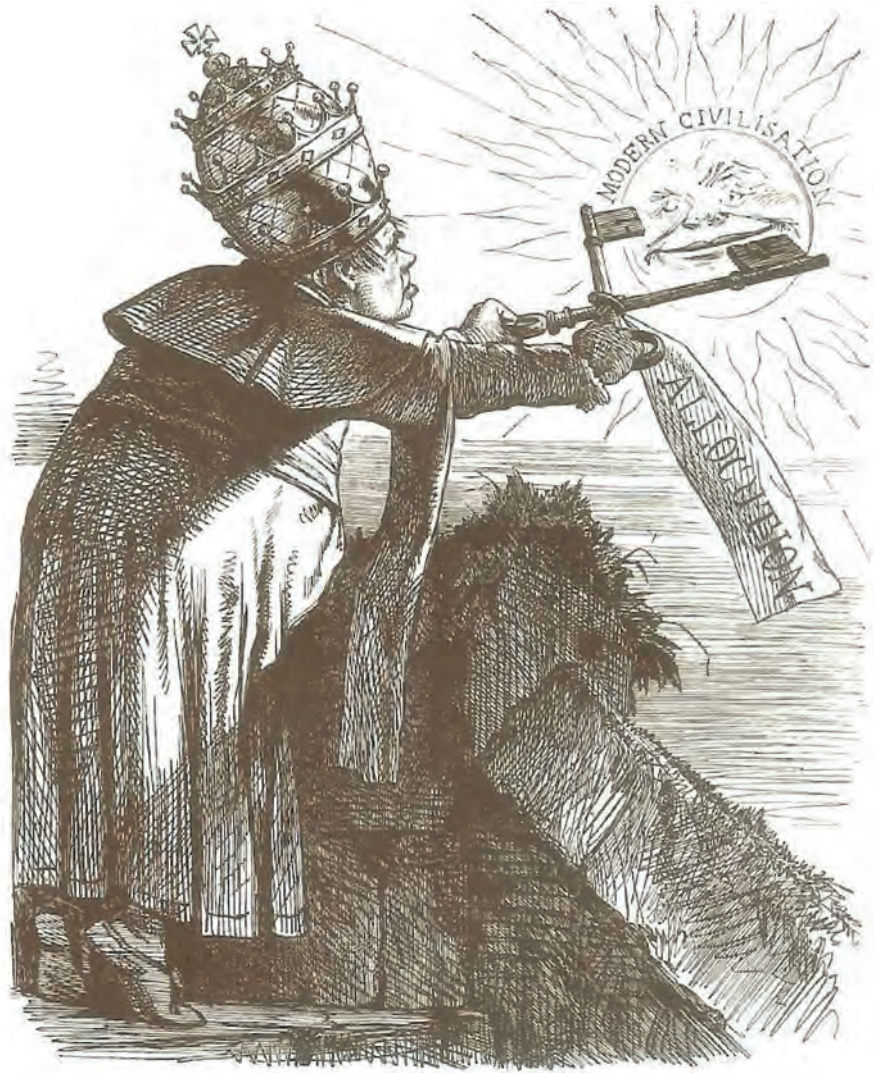
Papal Allocution.—Snuffing out Modern Civilisation.

2 Look at the cartoon, and then answer the questions which follow.