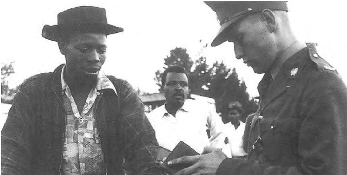
A photograph of a policeman inspecting the pass belonging to a black South African.

18 Look at the photograph, and then answer the questions which follow.