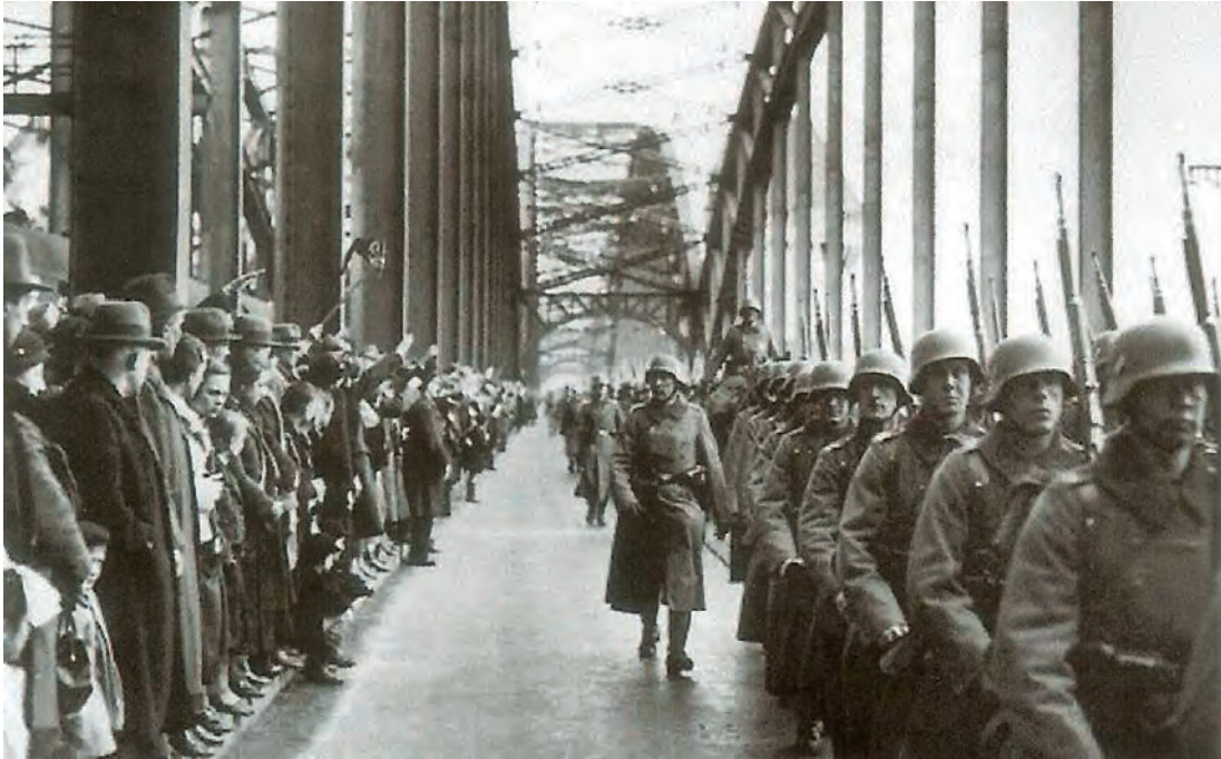
A photograph of German forces crossing the Cologne Bridge to enter the Rhineland in 1936.