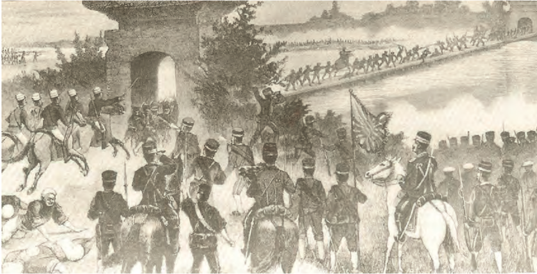
A painting of Japanese troops capturing Pyongyang in Korea during the war with China in 1894–5.