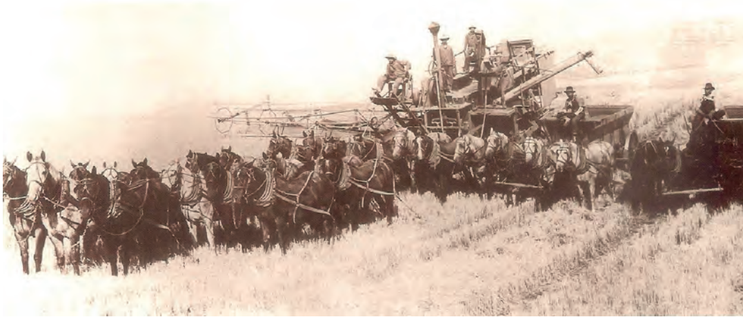
A photograph of recently introduced harvesting machinery on a farm in 1923.

13 Look at the photograph, and then answer the questions which follow.