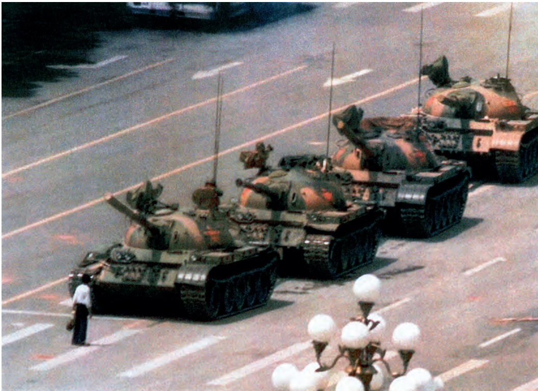
A photograph of tanks in Tiananmen Square, Beijing, June 1989.

16 Look at the photograph, and then answer the questions which follow.