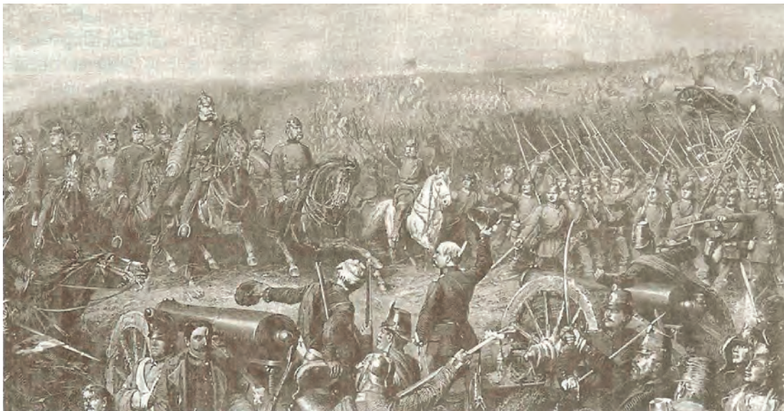
An illustration of the Prussian army defeating the Austrians at Sadowa, 1866.