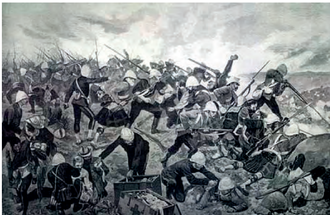
A picture of the Battle of Majuba Hill. British General Colley stands in the middle to the left. The British troops fire over the edge of the hill, down at the hidden Boer riflemen.

17 Look at the picture, and then answer the questions which follow.