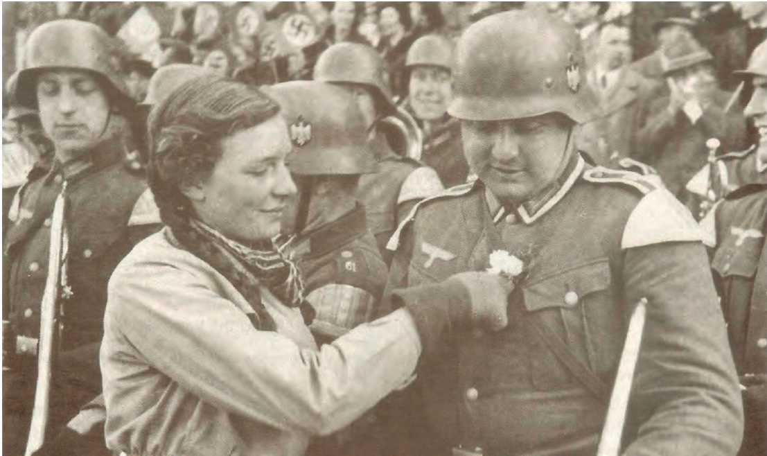
A photograph of a German soldier being given a flower after the Anschluss, March 1938.

6 Look at the photograph, and then answer the questions which follow.