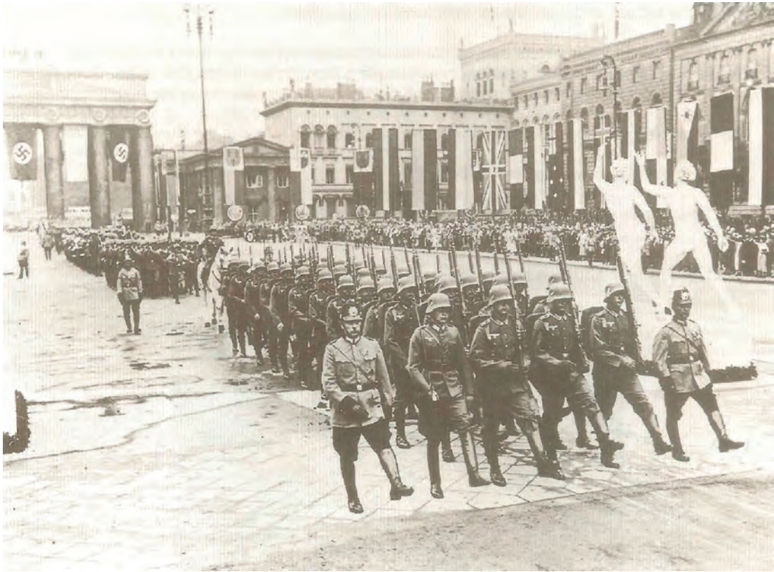
A photograph of a German military parade through the streets of Berlin at the time of the Olympic Games in 1936.

10 Look at the photograph, and then answer the questions which follow.