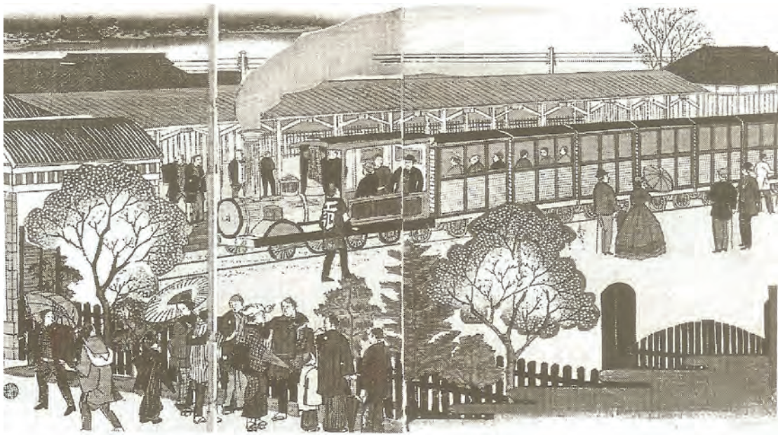
A print of the first Japanese railway, built in 1872.

4 Look at the picture, and then answer the questions which follow.