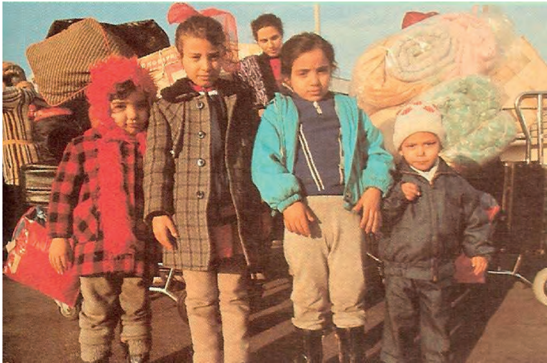
A photograph of Jewish children arriving at Ben-Gurion Airport in Israel in 1990. They have just arrived from the Soviet Union.

21 Look at the photograph, and then answer the questions which follow.