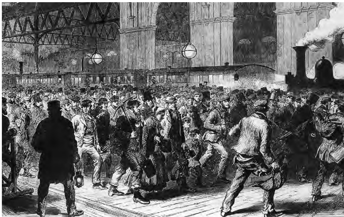
A painting showing the arrival of a working men's train, c.1860.

23 Look at the painting, and then answer the questions which follow.