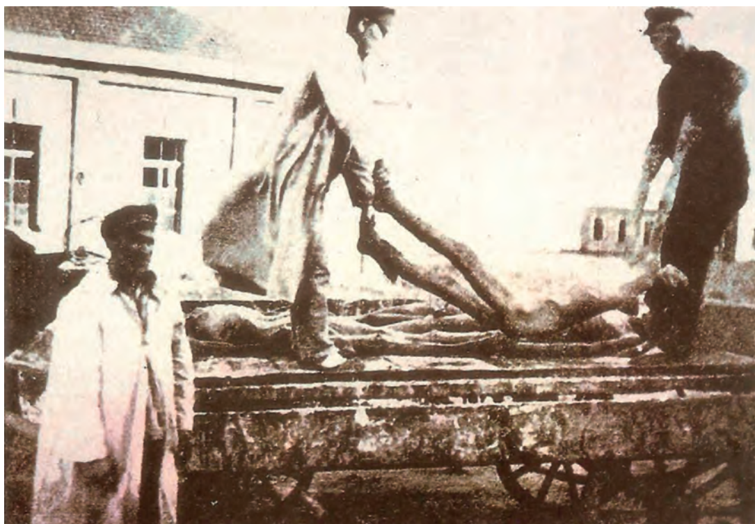
A photograph of the dead being collected during the 1932 famine.

12 Look at the photograph, and then answer the questions which follow.