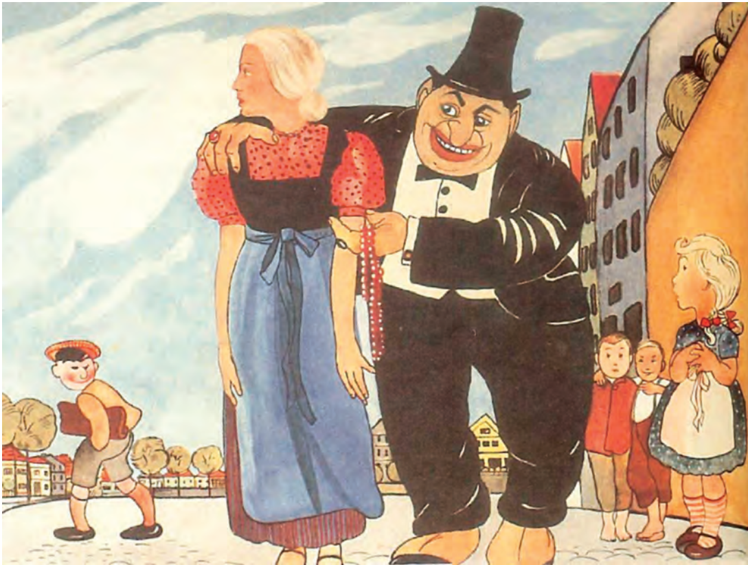
An illustration from a Nazi book for children published in the 1930s.

10 Look at the illustration, and then answer the questions which follow.