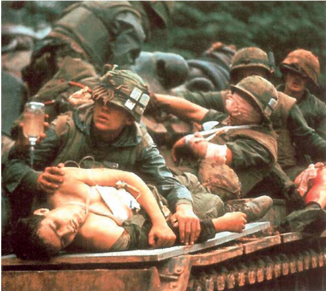
A photograph of wounded US Marines in Saigon during the Tet Offensive, 1968.