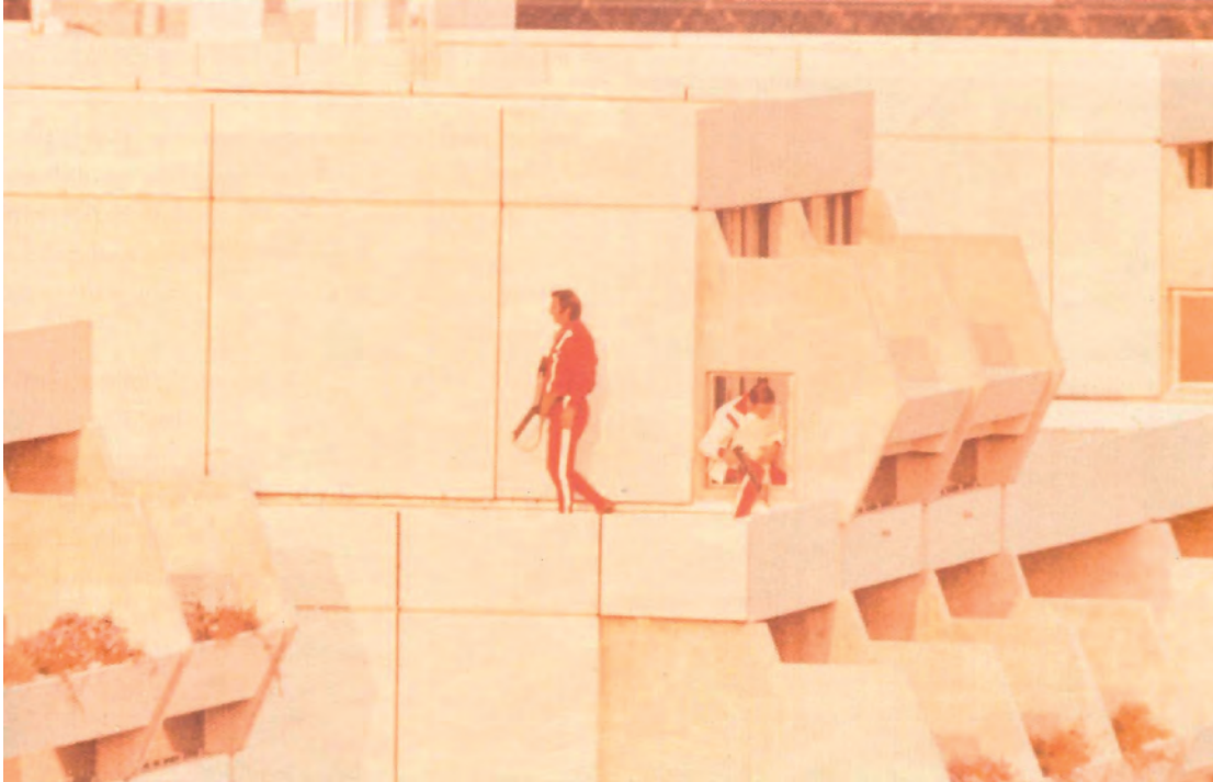
A photograph of an armed German policeman on a building in the Olympic village, Munich 1972.

20 Look at the photograph, and then answer the questions which follow.