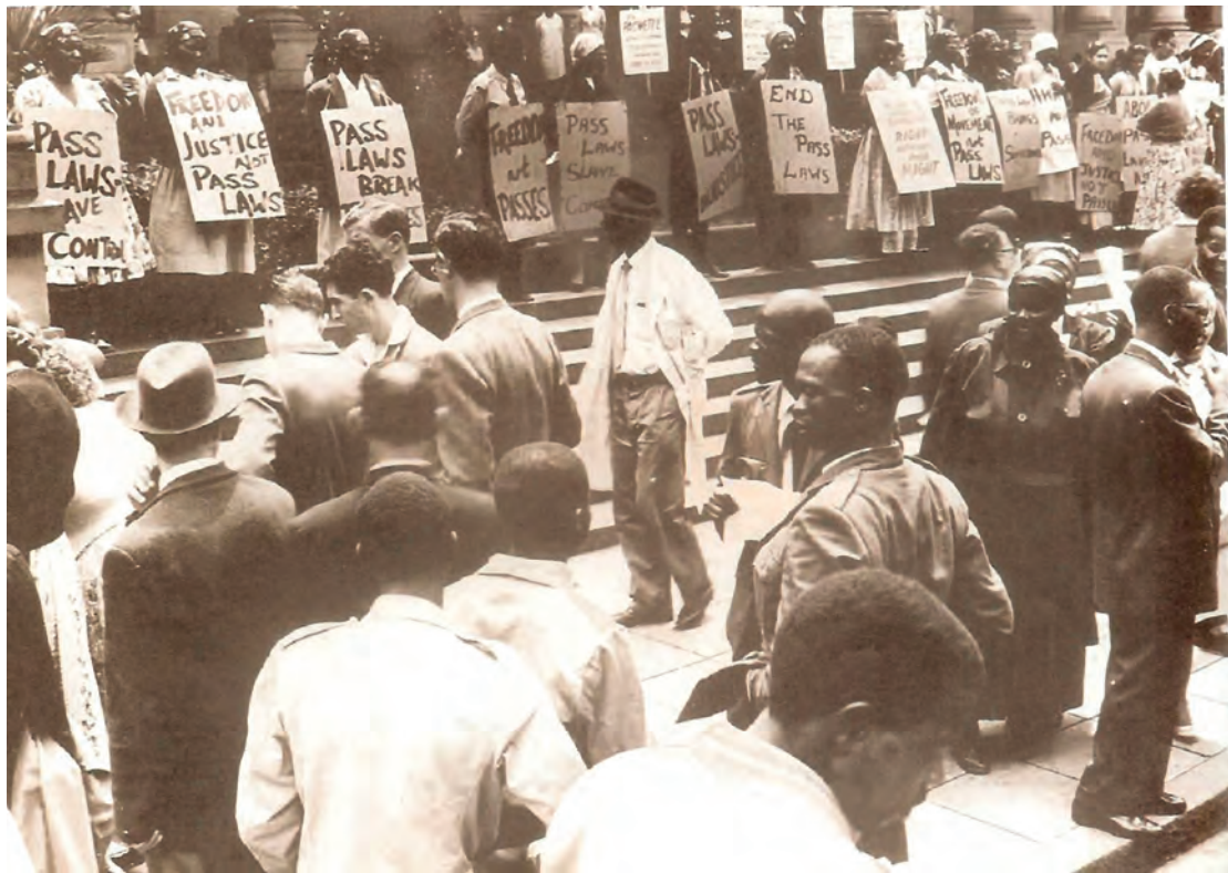
A photograph of women demonstrating against the pass laws in Johannesburg, 1955.

18 Look at the photograph, and then answer the questions which follow.