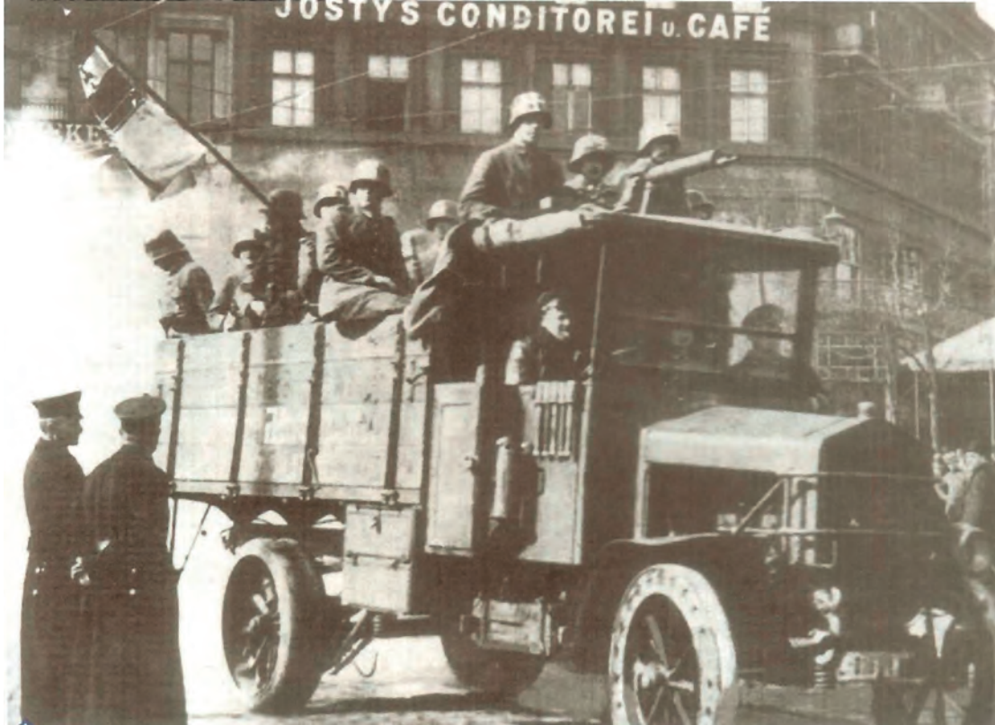
A photograph taken in Berlin in 1920, during the Kapp Putsch.