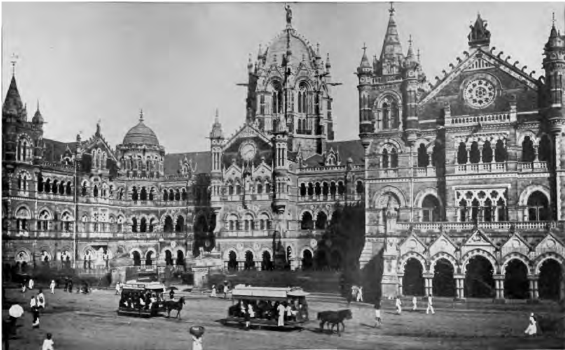
Victoria Railway Station, Bombay.

25 Look at the photograph, and then answer the questions which follow.