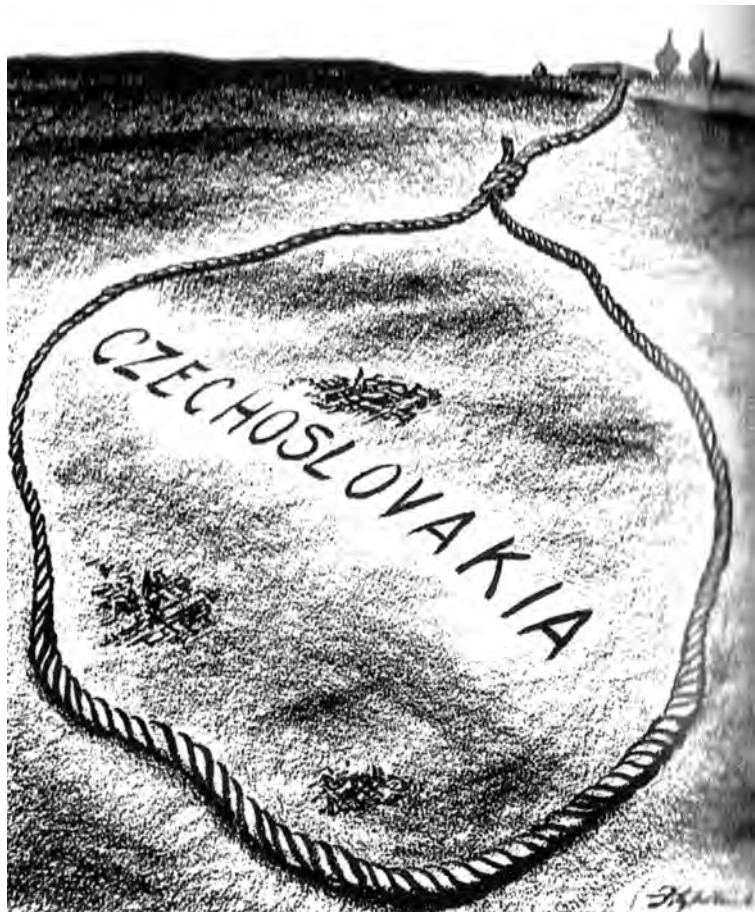
An American cartoon published in 1947. The title of the cartoon is 'When the time is right'.