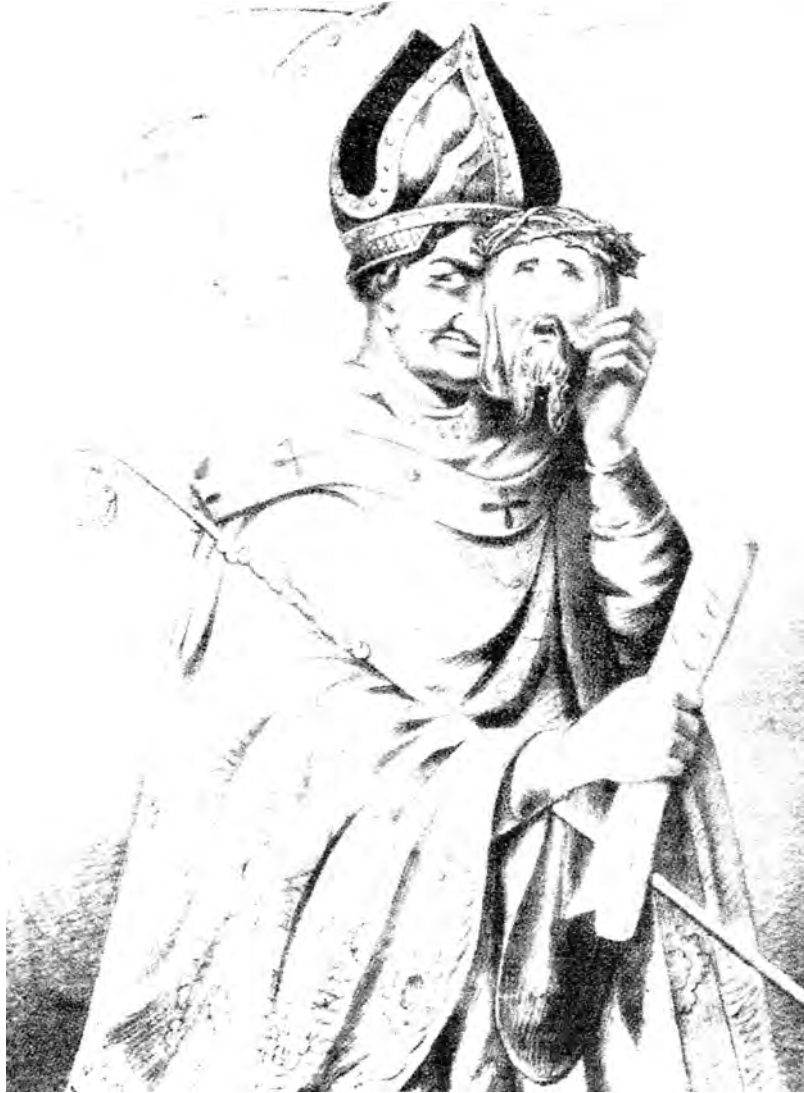
A cartoon of Pope Pius IX, published in Italy in 1852.