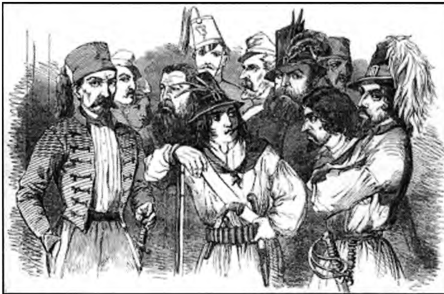
A drawing entitled 'Rome – Garibaldi's Men', published in an English magazine in July 1849.