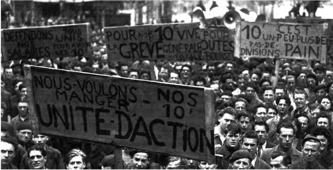
A photograph of workers in Paris demonstrating in 1947 for more pay, more bread and more united action by left-wing groups.