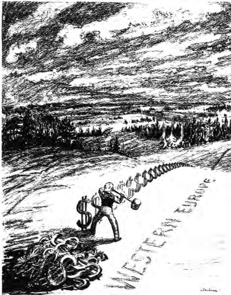
A cartoon published in Britain in 1947. The cartoon is called 'The Truman Line.'